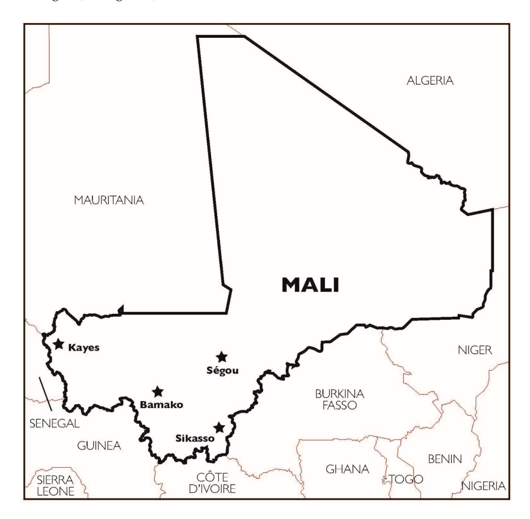
Figure 1. Mali's four largest urban cities.

The inventory focused on processed food products within the grain and dairy categories due to their importance in domestic commodity production, processing, and consumption. Both categories are also pivotal to food and nutrition security, as grains are the main staple and dairy products are a major source of animal protein [2]. The data for this study were collected in July and August 2016 across a range of retail outlets and neighborhoods in Mali's four largest urban cities: Bamako, Sikasso, Kayes, and Segou (see Figure 1).