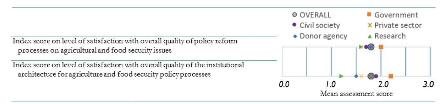
Figure 3: Indices of perceptions on the quality of policy reform processes and of the institutional architecture within which those processes take place in Malawi, by institutional type