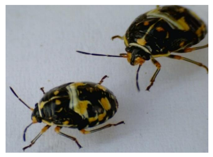
Image 1: Antestia bug, Antestiopsis thunbergii (Gremelin) (Hemiptera: Pentatomidae).

This study first evaluated the effectiveness of integrated pest management using pruning alone or in combination with several commercially available pesticides against a field population of antestia bugs. Previous research had shown that pruning was effective in reducing antestia populations because antestia prefer a shaded, damp