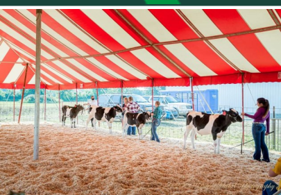
2020 4-H Show and Go - In partnership with the Genesee County Fair.

In 2020, Genesee County 4-H currently has 22 traditional livestock and horse 4-H Clubs serving 335 youth members ranging in ages 5-19 years old with 120 adult volunteers. 4-H also reaches a great number of youths through its afterschool programs. During 2020, Genesee County 4-H SPIN Clubs and other short term education programs reached 5,389 youth virtually in Genesee County. All 4-H programs offer youth an opportunity to learn valuable leadership and life skills for the future.