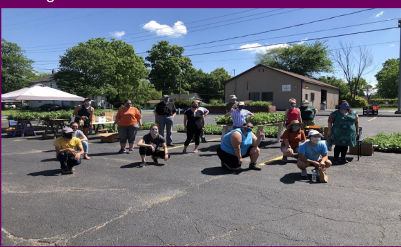
Volunteers at the 2020 Distribution Day

In 2020, a core group of volunteers supported work on the Edible Flint Educational Farm. Edible Flint donated over 3,000 pounds of food to community members and local food pantries. Volunteers worked to get the second hoophouse up and running and prepared additional garden beds for future planting.