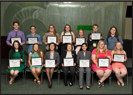
2019 State Award winners with their plaques at 4-H Exploration Days.

Michigan 4-H true leaders ages 11 and older have an opportunity to be recognized for the great work they do in 4-H by completing a state award application. A Michigan 4-H State Award is the highest honor bestowed on a Michigan 4-H member and provides an opportunity to receive recognition for their engagement in rich