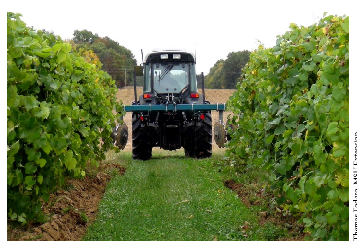
Figure 2. Hilling up soil onto trunks in fall (protection).

infection). When conditions are conducive for disease development, this specific ability allows the bacterium to produce galls at injury sites occurring in aerial parts of the vine. It also plays a critical role in the bacterium's dissemination through healthylooking infected propagation material.