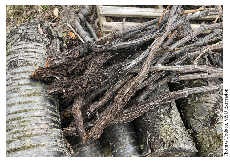
Figure 4. Symptomatic trunks removed from vineyard and placed in a pile to be destroyed (eradication).

GALLTROL-A (AgBioChem, Inc. Provo, Utah) is the only currently available commercial product. This product has different application methods including a pre-plant dip treatment or a treatment directly to the trunk and graft union. These treatments have been shown to be effective on other crops that develop galls, but conflicting results have been observed for grapes specifically.