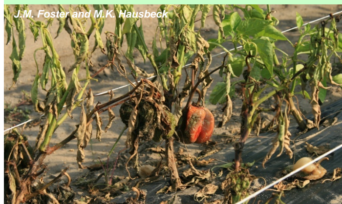
Foliar blight, fruit rot, and stem lesion symptoms.

Foliar applications of fungicides directed at the base of the pepper plant have offered only limited protection from crown rot. Apply foliar sprays using ample water volumes to achieve good coverage. Be sure to apply the fungicide before and after a period of rainfall expected to exceed ½ inch. Some products have been labeled for drip or drench applications.