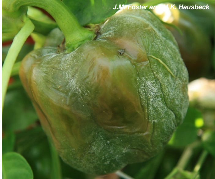
“Powdered sugar” Phytophthora spores on a bell pepper fruit.