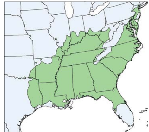
U.S. Geological Survey