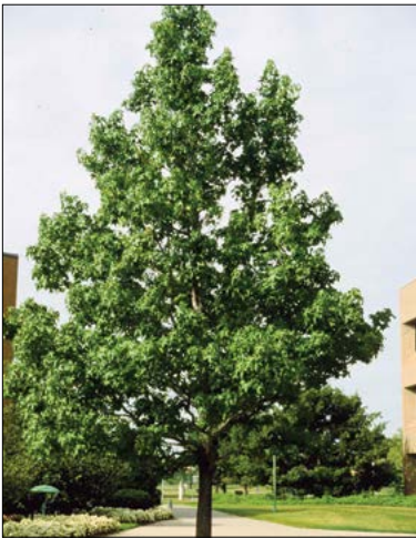
Jesse Saylor, MSU

Pests: Winter dieback is possible. Some problems with scale and bleeding necrosis, but relatively pest-free.