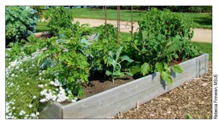
If drainage is an issue, raised beds can be very productive and easy to manage.

The site should be level and free of large roots and rocks. A level area will prevent water from running off and washing away seeds as well as soil erosion. Avoid low areas where water does not drain. For good plant health, roots require moisture, but also need oxygen. Standing water or heavily compacted soil does not allow roots to breath. Refer to the tip sheet on "Smart gardens begin with healthy soil" for more information on how to improve your soils.