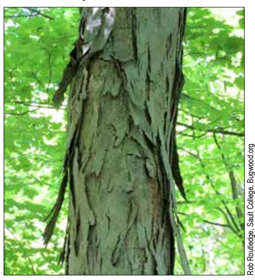
Textured bark of shagbark hickory.

one kind of tree or shrub into your landscape. This is like insurance against insect pests, diseases or other problems that could come along. Only a small part of your landscape would be damaged when an unforeseen problem arises, and diversity makes for a more interesting landscape. Using native trees and shrubs can help establish a sense of place and can be low maintenance.