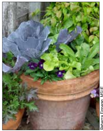
Vegetables can be grown in a wide variety of containers, and they need not be fancy. Even a burlap bag will do.