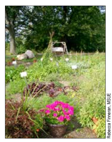
The large tree in the back casts a shadow, causing the garden's back side to be less productive than the front.

Before you select the site, observe it for a few days to determine the amount of sunlight it receives. Is there sun in the early morning? Is the site in the shadow of neighboring trees, shrubs, fences or other structures? At noon, is the entire area in full sun? What are the light conditions at 2 p.m. and 4 p.m.? Take time to observe and make notes in order to locate the garden in the best area of your landscape. Keep