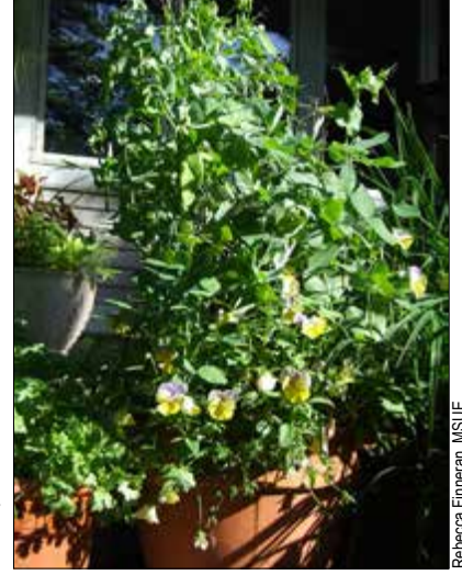
Contaner with edible peas on a trellis for support and pansies to provide color and a living mulch. Pansies are also edible.