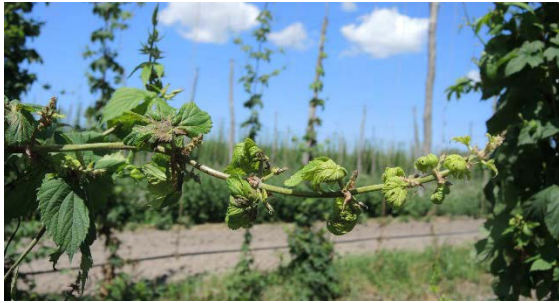
Stunted side-arm growth and distorted, pale leaves caused by downy mildew infection on hop.