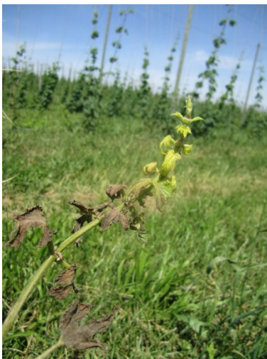
Yellow and stunted spring hop spike, systemically infected with hop downy mildew with spore masses on leaf tissue.