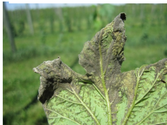
The downy mildew pathogen spore masses on the underside of a hop leaf, note the small angular water-soaked lesions where sporulation has not yet occurred.