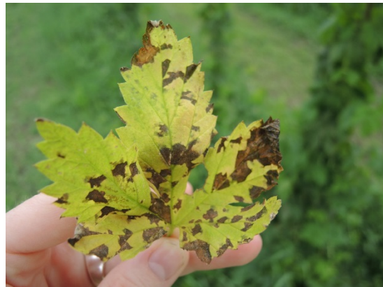
Angular lesions on the upper leaf surface of hop caused by downy mildew infection.