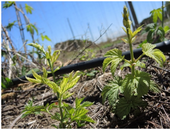
Glyphosate injury on the left and downy spike on the right.

injury on the first flush of growth is very common so it is important that growers recognize the difference. Herbicide injury will cause chlorosis that follows leaf venation and leaves will be misshapen and appear more “strappy”. Glyphosate injured growth will also lack the signs of downy including the spore masses on the underside of leaves. Infected shoots develop spore masses on the underside of leaves that follow venation. As secondary infections occur, leaves develop angular water soaked lesions that follow leaf venation. Eventually, the water-soaked lesions turn brown and necrotic with fuzzy and grey-black asexual spore masses developing on the underside of infected lesions. As bines continue to expand new shoots becomes infected, brittle, and fall away from strings. Growers can attempt to retrain new shoots but often incur yield loss as a result of missing the ideal training timing. As the season progresses, symptoms may include stunted side-arm growth, tip die-back and cone discoloration. The fuzzy, visible growth of downy mildew is not always present on cones and should not be relied upon as the sole indicator of whether infection is present.