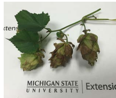
Stunted side-arm growth and distorted, pale Downy mildew infection on cones.