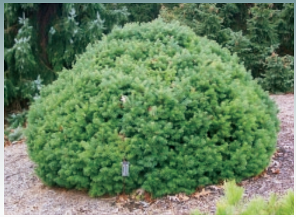
See me... Feel me... (with apologies to The Who ). According to Chub Harper, everyone that sees this 'Green Globe' alpine fir (Abies lasiocarpa 'Green Globe') has to touch it.