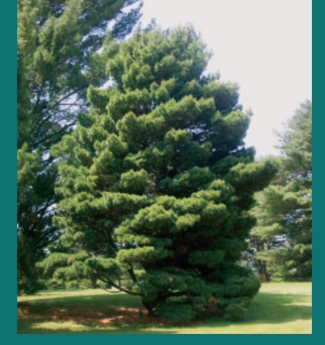
This dwarf eastern white pine at the Morton arboretum is over 20 feet tall and shows the dramatic character of mature dwarf conifers.