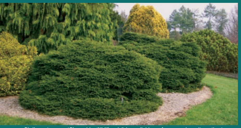
Bird's nest spruce ( Picea abies 'Nidiformis') is a reliable performer and an alternative to other foundation plants.

Curious yellow. This Chamaecyparis obtusa 'Nana Lutea' is a dramatic specimen plant.