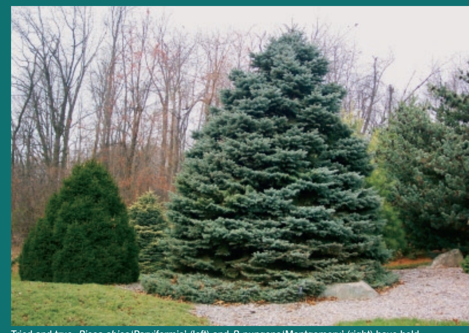
Tried and true. Picea abies 'Parviformis' (left) and P. pungens 'Montgomery' (right) have held up well over the years in the Harper Collection at Hidden Lake Gardens.