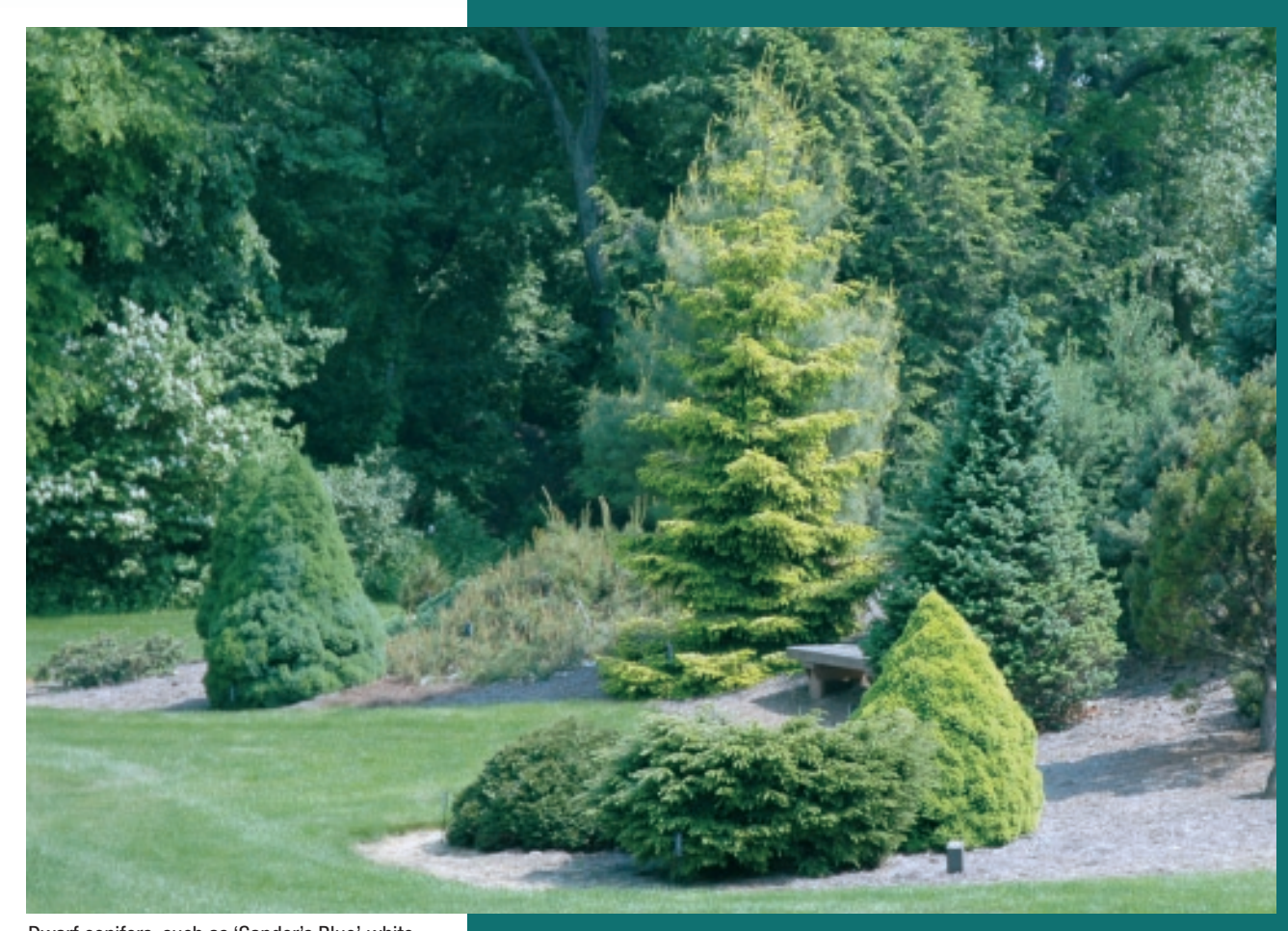
Dwarf conifers, such as 'Sander's Blue' white spruce (left) and 'Rainbow's End' white spruce (right), are great accent plants.

5. Picea pungens 'Montgomery' Montgomery Colorado spruce