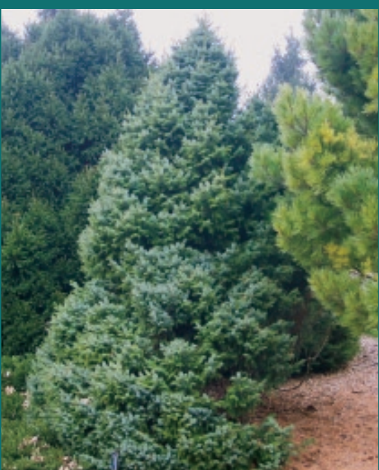
Serbian spruces are reliable plants and this dwarf form ( P. omorika 'Nana') is no exception.