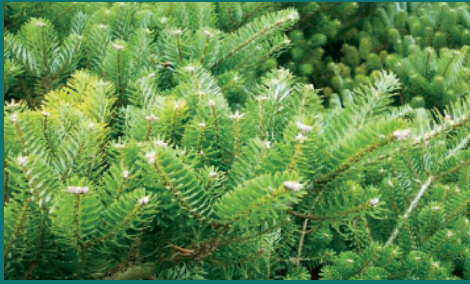
Compact Dwarf Korean fir ( Abies koreana 'Compact Dwarf') has a broad, compact growth habit. Its short needles add texture to the landscape.

For those that still need a blue spruce fix and are short on space, here's your plant. Globe-shaped when young, Montgomery is often grafted high on a standard for the 'lollipop-on-a-stick' effect. Becomes broadly pyramidal with age. Bright blue color is a real show-stopper. Chub notes: "This one's going to take over the world."