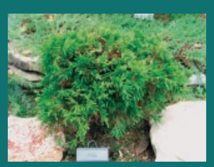
Thuja plicata 'Grune Kugel' has a rounded form that holds up better to snow than some globe conifers.