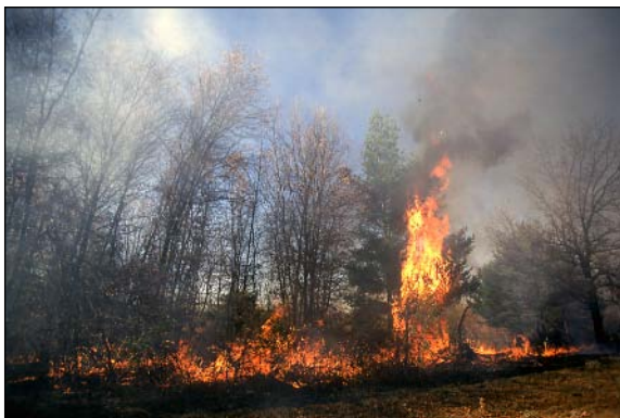
Figure 1. Some trees and plants can burn intensely.

Most Michigan residents are surprised to learn that Michigan experiences as many as 8,000 to 10,000 wildland fires each year. These forest fires, brush fires and grass fires destroy or severely damage 100 to 200 homes, barns and outbuildings annually. This can happen when firebrands (floating embers or pieces of burning debris) land in dry leaves that have collected under decks, around landscape plants and in eavestroughs, setting the