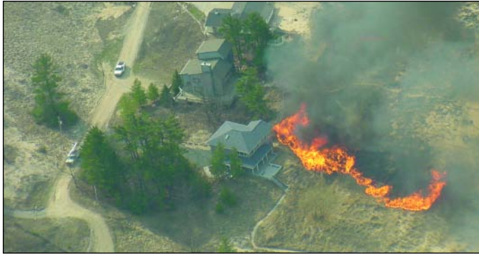
Figure 2. This wildfire in dune grass near Shelby, Michigan, in 2005 produced flames 20 feet high and destroyed two homes.

area or an urban community bordered by natural vegetation where wildfire is a possible threat.