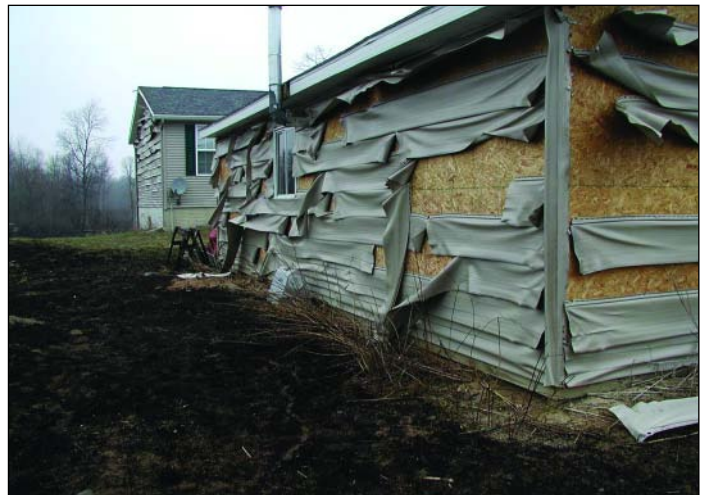
Figure 4. A wildfire in a grassy field melted the siding on this garage and home.

It is also important to provide adequate water for newly planted trees and shrubs. Once these plants have grown and have established extensive root systems, they should usually be able to absorb sufficient nutrients from the soil and from lawn fertilizers. Regular watering will still be necessary, however, to reduce the possibility of ignition. Ornamental plants may or may not need special fertilization. This can be determined by a soil test, which is available through your local Extension office. For more information, pick up a copy of North Central Region publication 356, Fertilizing Garden & Landscape Plants & Lawns , from your county Extension office.