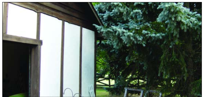
Figure 3. The spruce trees in this photo are located too close to the house. If they catch fire, they will likely create enough radiant heat to ignite the home.

When creating defensible space in the yard, provide a minimum of 3 feet of clearance between the building and landscape plants. Non-flammable landscape material such as limestone, marble chips or even mineral soil can be used in this area. Avoid using organic mulch such as peat or wood chips within the 3-foot barrier. These materials can ignite when dry.