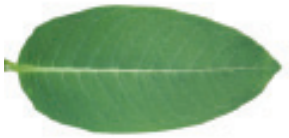
Common milkweed leaf.