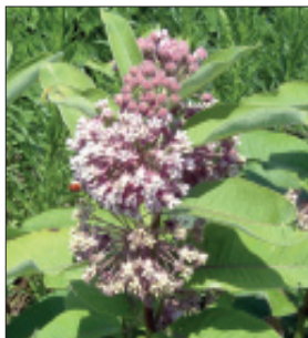
Common milkweed flower