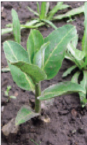
Young common milkweed plant.

Stout and erect, rarely branched, up to 6-foot-tall herbaceous stems are finely hairy and hol-