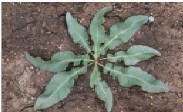
Curly dock rosette.