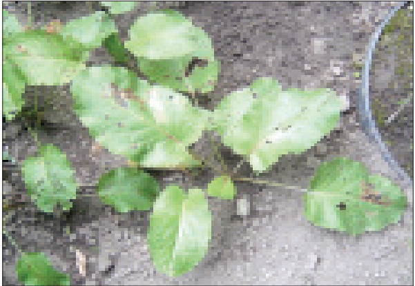
Broadleaf dock rosette.

Differs by having much wider, broader leaves and usually heart-shaped leaf bases.