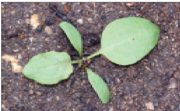
Curly dock seedling.