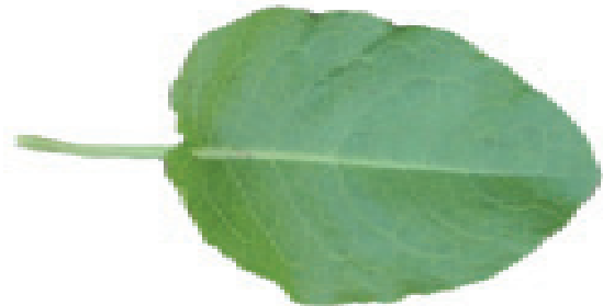
Broadleaf dock leaf.