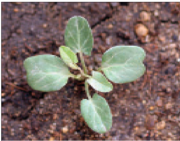
Field bindweed seedling.

White to pink petals fused into a funnel shape with two leafy, small bracts approximately 1