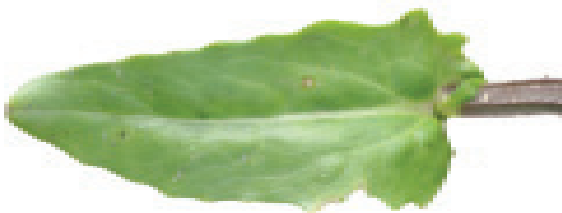
Field pennycress upper leaf.