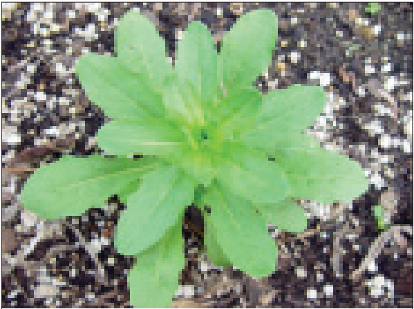
Field pennycress rosette.

Erect, mostly 2-foot-tall stems with varied branching bolt from a basal rosette to flower.