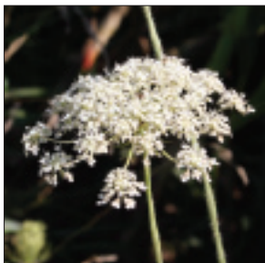
Wild carrot flower cluster.