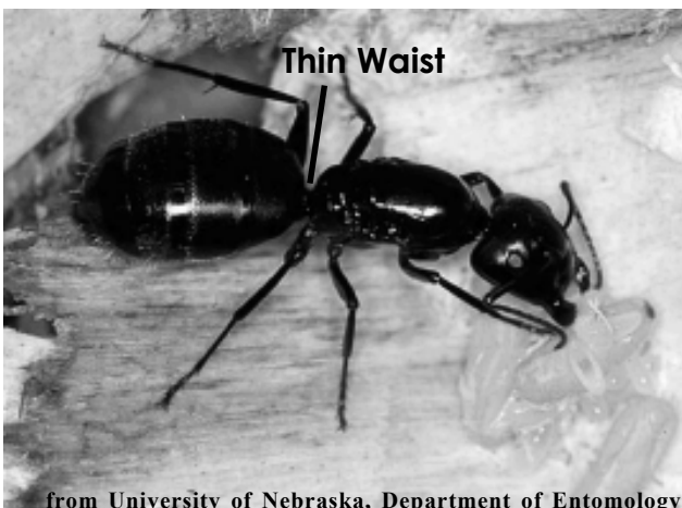
from University of Nebraska, Department of Entomology