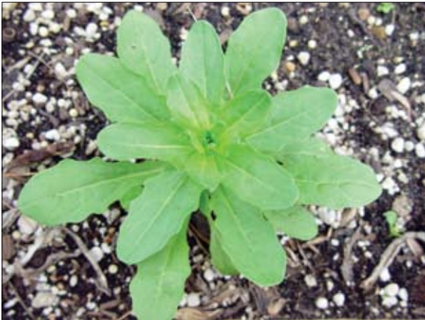
Field pennycress rosette.