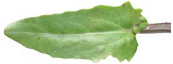
Field pennycress upper leaf.