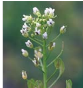
Field pennycress flowering cluster.