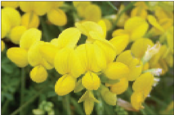
Birdsfoot trefoil flowers.