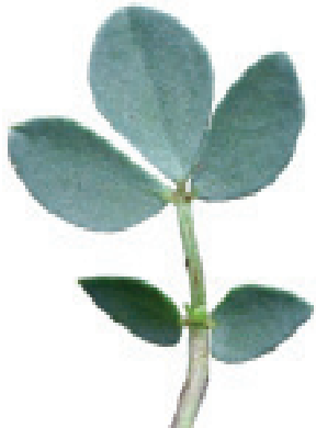
Birdsfoot trefoil leaf.

Bright yellow, pealike flowers, sometimes streaked with red, are found in flat-topped clusters at the ends of long stalks. Fruit are several linear, cylinder-shaped pods formed in the shape of a bird's foot. Each capsule contains several roundish, shiny, olive to black seeds.