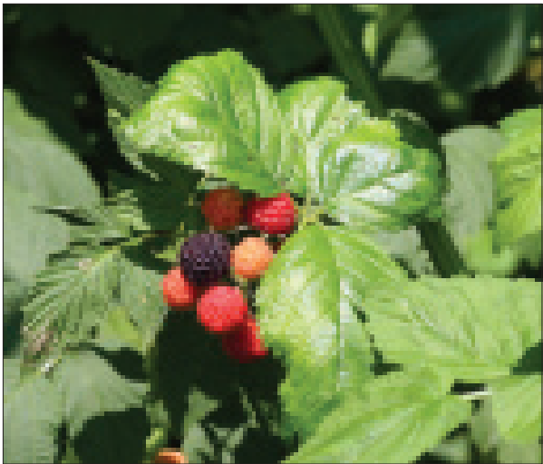
Raspberry foliage and fruit.

Arching/trailing stems that root when in contact with the ground to form thickets. Stems have fine bristles or stiff prickles.