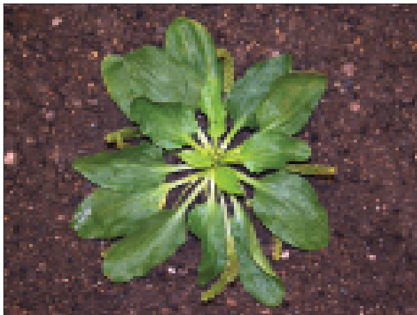
Broadleaf plantain rosette.