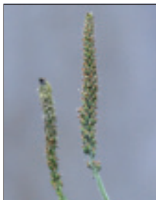
Broadleaf plantain flowering spikes.

No visible aboveground stem. Short taproot present.