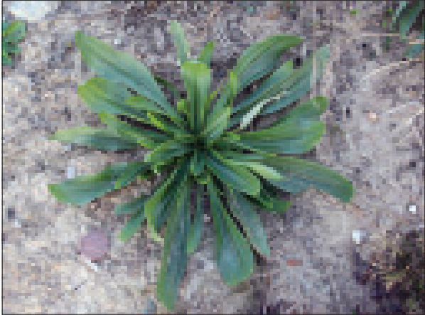
Buckhorn plantain rosette.