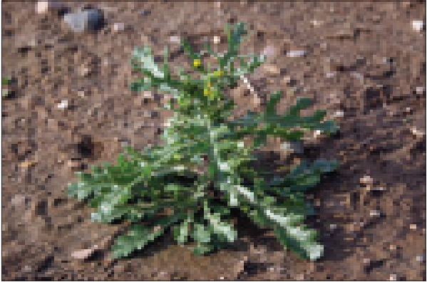
Common groundsel plant.