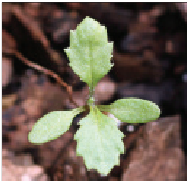
Common groundsel seedling.

Alternate, sparsely hairy to smooth with variable leaf shape. Young leaf margins may be smooth to slightly wavy; older leaves have deep, irregular lobes and