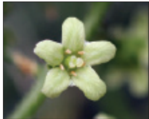
Poison ivy flower.