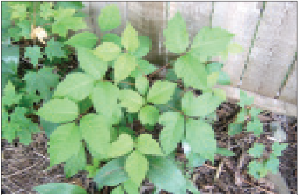
Poison ivy foliage.

Shrubby or climbing, woody vines are supported by aerial roots.