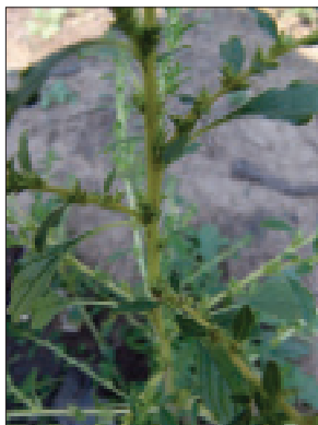
Whitish stems of tumble pigweed.