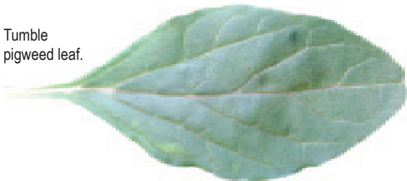
Tumble pigweed leaf.