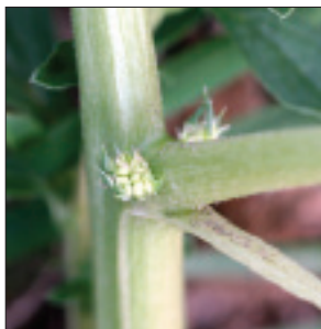
Tumble pigweed flowers.