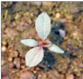
Tumble pigweed seedling.

Mostly erect and usually hairless, pale green to whitish stems with multiple branches create a bushy appearance. Stems, up to 4 feet tall, break off at the soil surface when mature and tumble with the wind.