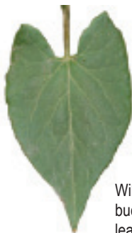
Wild buckwheat leaf.