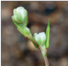
Wild buckwheat flowers.