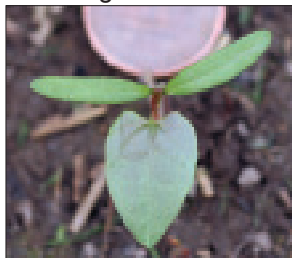
Wild buckwheat seedling.