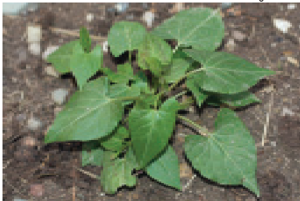
Wild buckwheat plant.