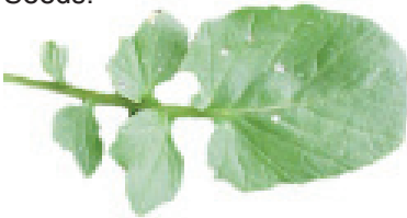
Yellow rocket lower leaf.