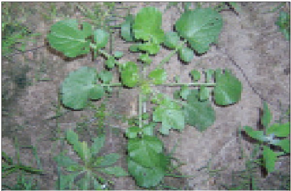
Yellow rocket rosette.