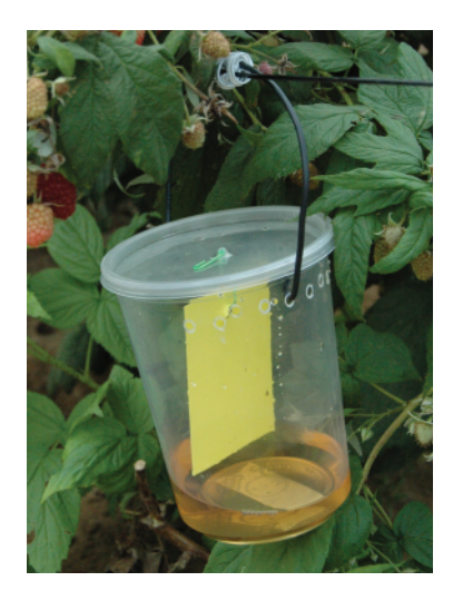
Monitoring trap for SWD. A plastic container with holes, containing apple cider vinegar as a bait, and a sticky trap to catch flies.

Control: There are some important cultural controls that growers can adopt to minimize the buildup