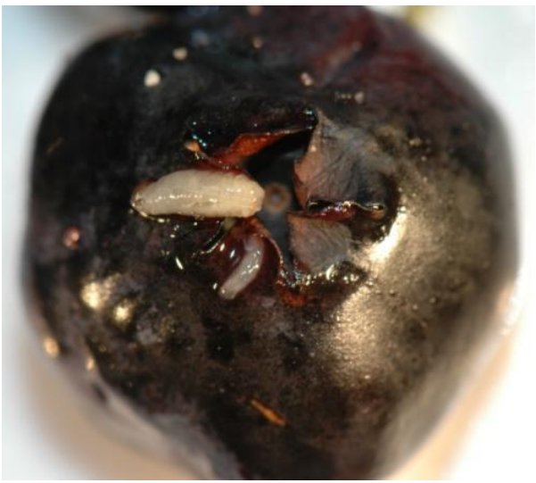
Relative size of blueberry maggot larva (top) and SWD larva (botatom).

Berries can also be sampled using the standard boil test used by processors for blueberry maggot detection. To do this, cover a sample of berries with water and boil for one minute then pour the fruit and liquid onto a mesh-covered frame over a tray and mash the fruit with the back of a spoon. Lightly wash through with water and look in the tray for larvae. This method works very well for detecting SWD larvae, which are smaller than blueberry maggot (see photo). It should be noted that young blueberry maggot larvae are difficult to distinguish from SWD larvae, but specimens can be separated based on their shape, and the structure of the larva from features visible under a microscope. Although the boil test is used as a standard sampling method for checking fruit by processors, it would be better to detect any potential infestation in the field and control it before any infestation reaches the processor.