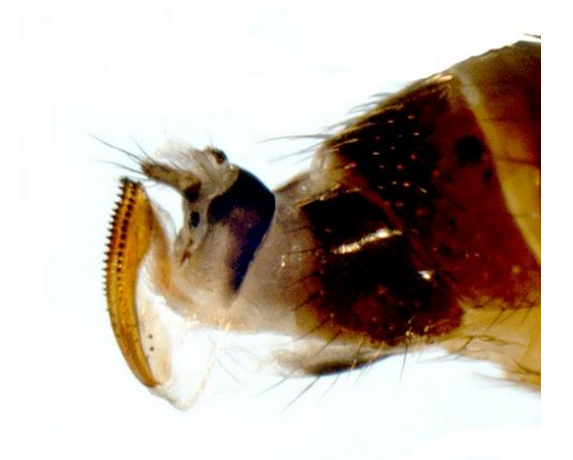
The ovipositor of female SWD is serrated, allowing them to cut into intact berries.