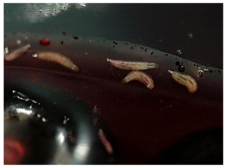
SWD larvae emerged from fruit and floating in a strong salt solution

A practical way to do fruit extraction for detecting drosophila larvae is to mix a large jug of the salt solution to keep on hand, in a truck or back at the barn. Then take fruit samples into ziplock bags marked with the date and field. Once samples are taken, lightly crush the berries and add the solution. Hold the samples up to the light to look for larvae, after at least 30 minutes exposure to the salt solution. Use of warm/hot water is expected to speed up this process.