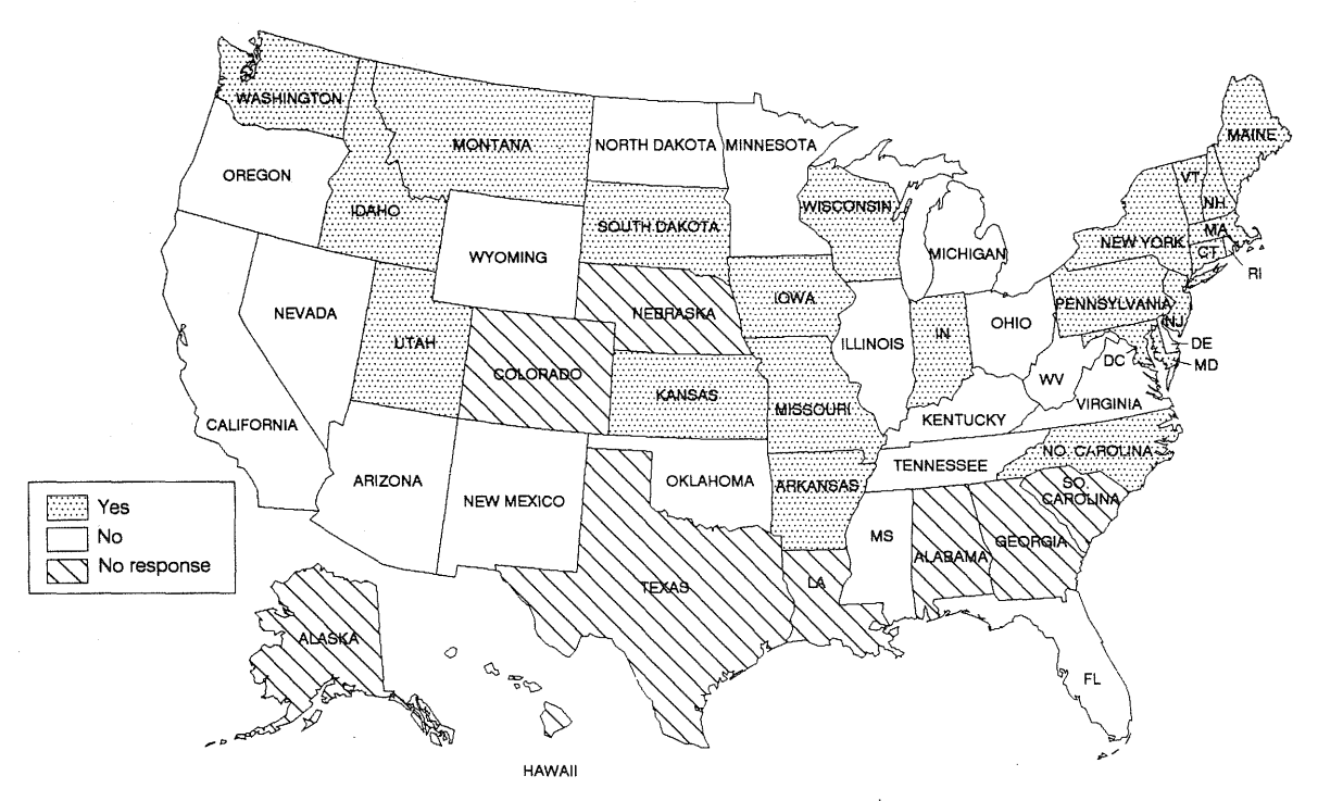
Fig. 2-6. States in which the state commission or its utilities have a date-based restriction electric disconnection moratorium policy.