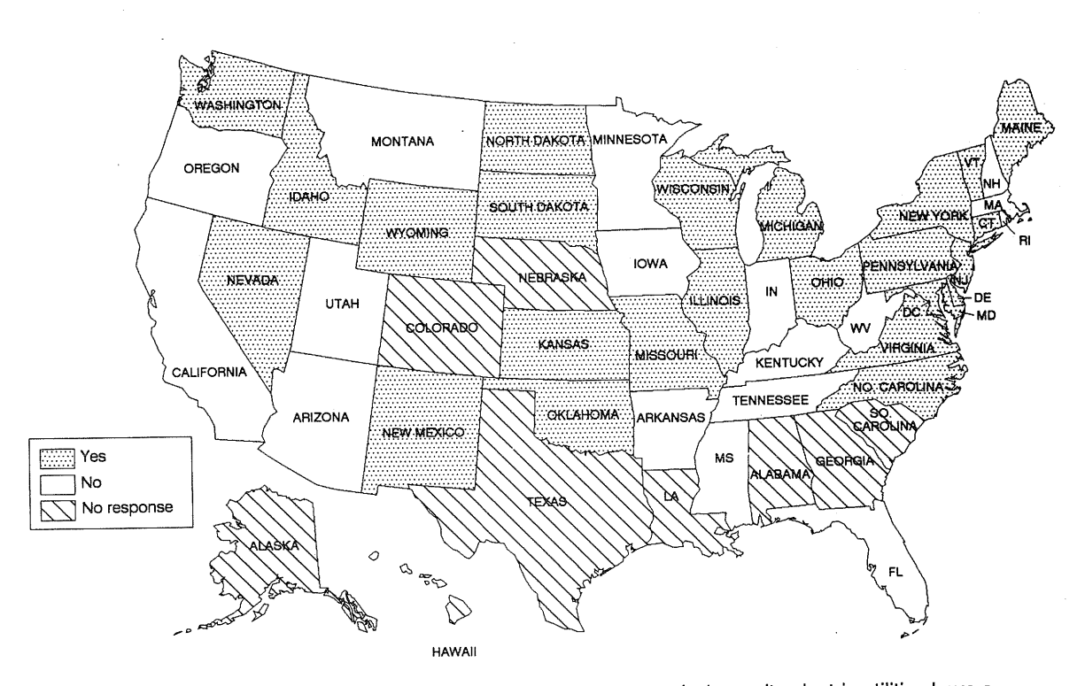
Fig. 4-10. States in which the state commission or its electric utilities have a policy that provides for referral services.