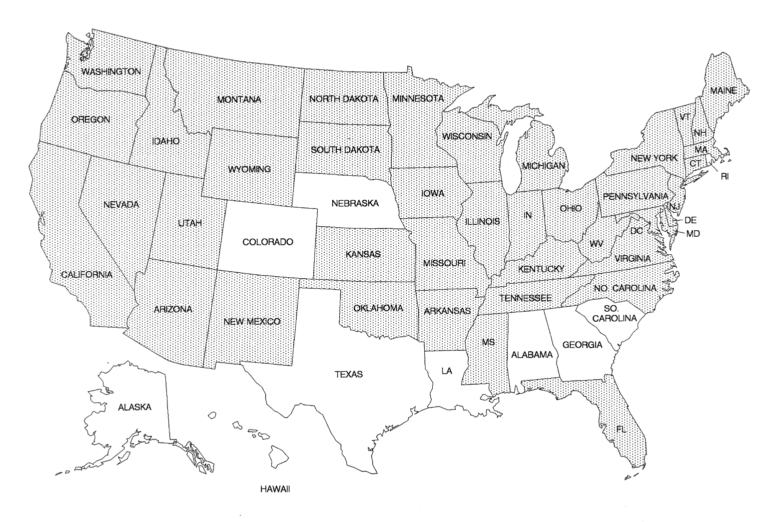
Fig. 1-2. States filling out the NRRI survey.