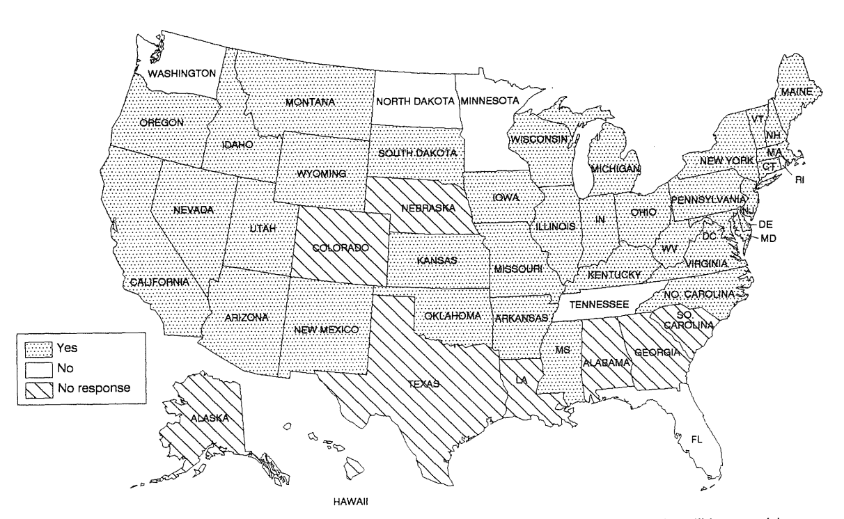
Fig. 3-8. States in which the state commission or its electric utilities provide for deferred billing in lieu of disconnection.