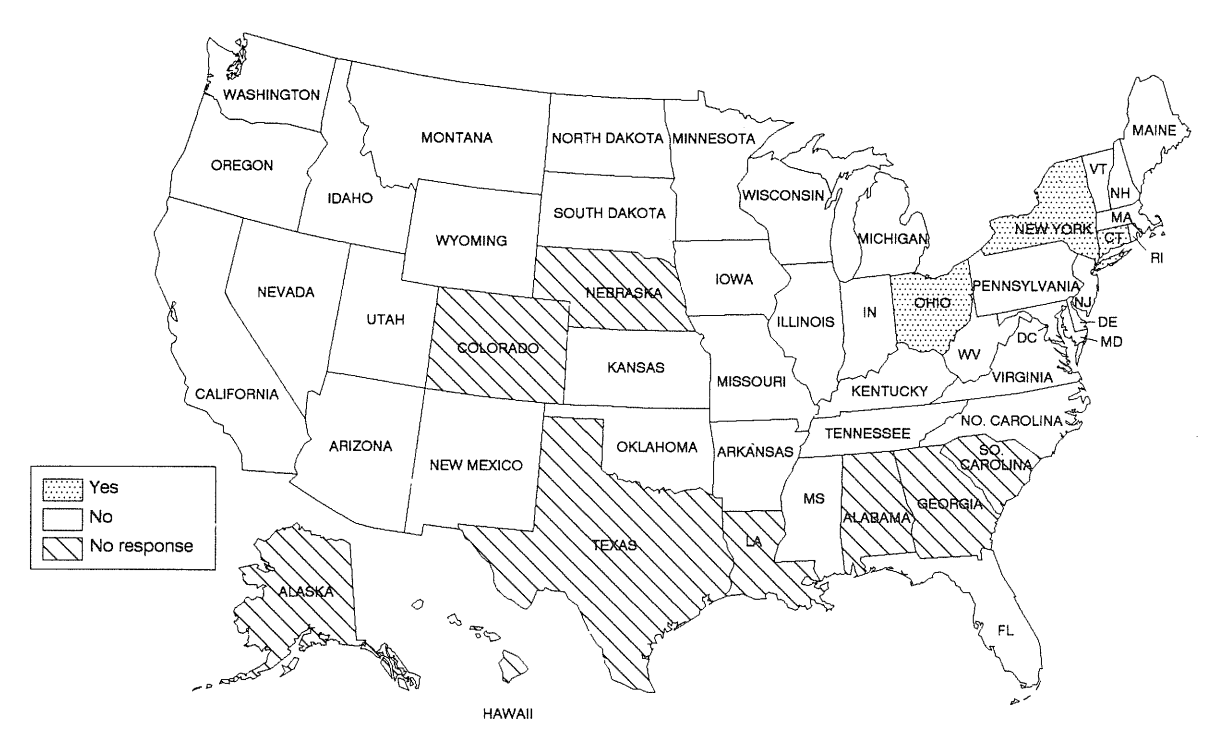
Fig. 3-10. States in which the state commission or its electric utilities provide for arrearage forgiveness as an alternative to disconnection. Source: NRRI survey results.