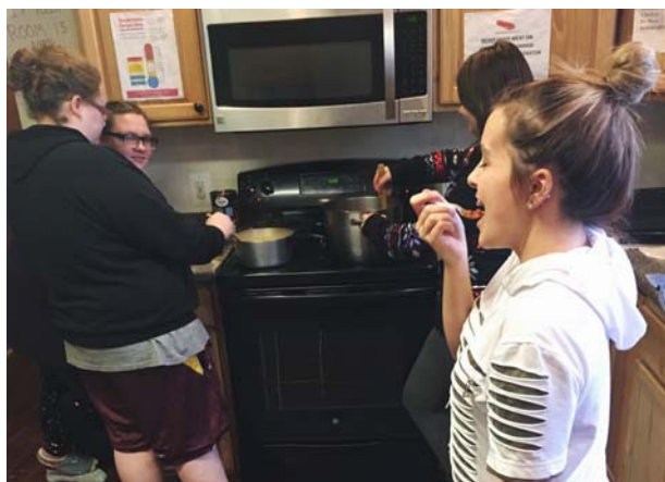
Kids learn to make healthy snacks during "Cooking Matters for Teens."

MSU Extension's Supplemental Nutrition Assistance Program provides basic nutrition education and hands-on activities for all ages. Core curricula are designed to help low-income families stretch their food dollars while maintaining good nutrition. Some instruction includes physical activity and cooking techniques that help instill life-long skills. It is estimated that every $1 spent on nutrition education saves as much as $10 in long-term health costs.