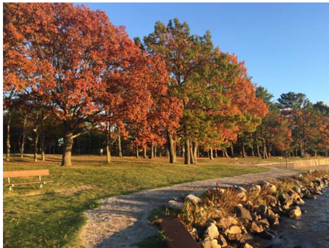
Learning land division law is important for local officials, developers, and property owners.

Conducting Land Division Reviews is a technical training for persons interested in the Michigan Land Division Act. It provides a detailed system of conducting the review, and provides an application form that can be customized to local land division and zoning ordinances. Upon course completion, participants know who can conduct reviews, what a parent parcel is and how that is determined, the statutory and case law limits on what the review is for, and how to apply a detailed local review process.