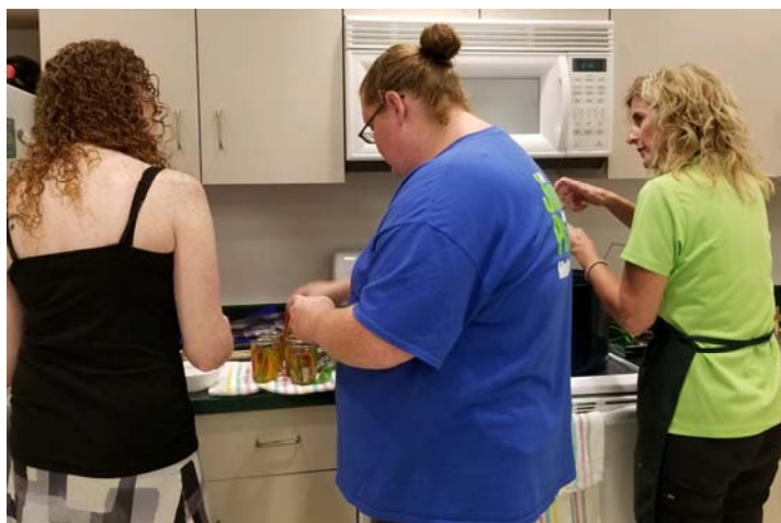
Learning to can using up-to-date safe methods reduces the risk of food-borne illnesses.

Providing quality education programs to help residents and businesses keep food safe is a hallmark of cooperative extension services across the country. In Isabella County, we offered classes in food preservation, cottage food law, safe food handling in food pantries, ServSafe, Cooking for Crowds and pressure canner gauge testing. Utilizing partnerships with local organizations helps create environments for successful trainings.