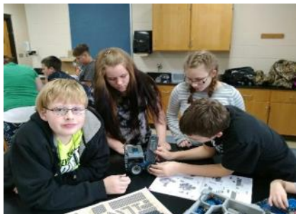
The 4-H After-School Robotics Club in Iosco County received a $1,000 Michigan 4-H Legacy Grant to use VEX Robotics as a tool to help club members develop life skills.

Learn more or apply online at http://mi4hfdtn.org/grants . Questions? Contact the Michigan 4-H Foundation at 517-353-6692.