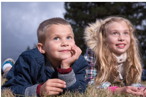
Starting Sept. 1, youth ages 8 to 19 will be eligible to enjoy the full Michigan 4-H experience.

Beginning September 1, 2018, the Michigan 4-H Participant Age Policy will change to reflect a younger beginning age for 4-H members. The new age for 4-H members will be 8 to 19 years old, continuing to use January 1 of the program year as the date of calculation. The 4-H Cloverbud experience will remain available to youth ages 5-7.