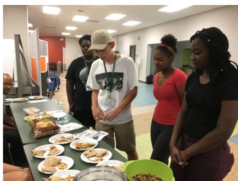
The 4-H Health and Food Science camp is designed for 4-H members who are passionate about nutrition, food science, physical fitness, and sports.

This three-day pre-college program takes place at MSU and is open to volunteers and youth ages 13-19. Youth will work together in teams to develop a plan that addresses health issues within their community and explore various health-related career fields.