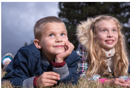
Youth ages 8 to 19 as of January 1 of the program year are eligible to be Michigan 4-H members.

The new 4-H programming year is finally here, and with it comes changes to the Michigan 4-H Age Policy. Beginning September 1, the Michigan 4-H Participant Age Policy reflects a younger beginning age for 4-H members. The new age for 4-H members is 8 to 19 years old, continuing to use January 1 of the program year as the date of calculation. The 4-H Cloverbud experience will remain available to youth ages 5-7.