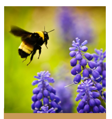
MSU Extension supports the Michigan Pollinator Initiative to address priority issues that threaten pollinator populations.