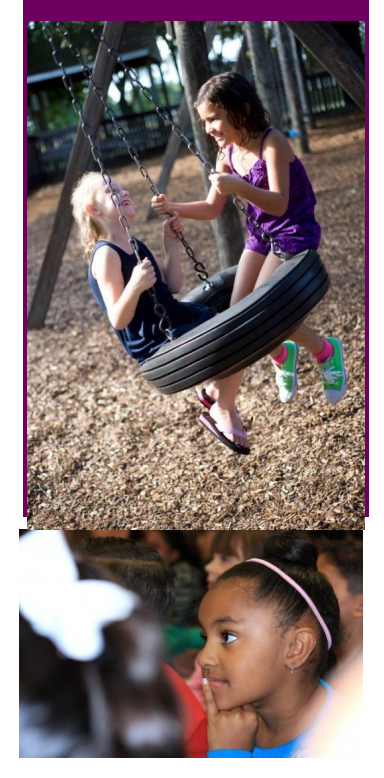
Children can be taught how to pay attention and pause before reacting to stress.

Encouraging healthy behaviors helps reduce health care costs by providing safe environments throughout a person's life span.