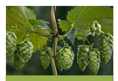
A 2015 economic study determined beer tourism was driving over $12 million in economic output in Kent County.

MSU Extension provides valuable education, research and demonstration throughout the state to support current and prospective producers of emerging crops. Increased growth in craft beer results in increasing opportunities for Michigan producers to help supply hops and malting barley to this growing market. The emerging craft beer raw material sectors provide a major opportunity for rural and regional economic development.