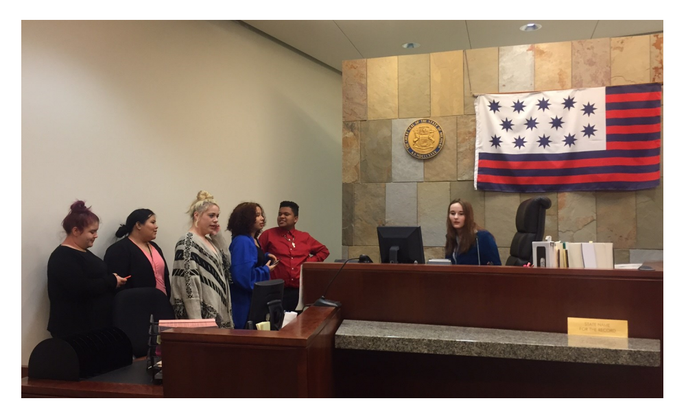
Nine members of the United Youth Leadership Program of the Notawaseppi Huron Band of Potawatomi participated in a field trip to many Kent County government departments in March 2016.

In 2016, 4-H partnered with the Notawaseppi Huron Band of Potawatomi to offer the United Youth Leadership Program. Through this program, nine youth were able to learn about tribal, county, and state government. The group toured the Pine Creek Reservation in Fulton, Michigan as well as Kent County governmental offices including the Kent County Recycling Facility, the Animal Shelter, the Kent County IT Department, Kent County Courts, the Sherriff's Department, and the group attended a Kent County Board of Commissioners meeting. In addition, the group participated in the 4-H Capitol Experience in Lansing to learn and experience state government. Students reported an increase in knowledge of tribal, county and state government as a result of this program.