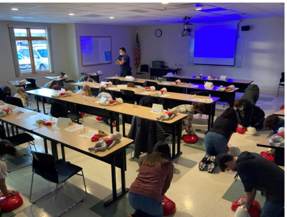
Babysitting Club Practicing CPR