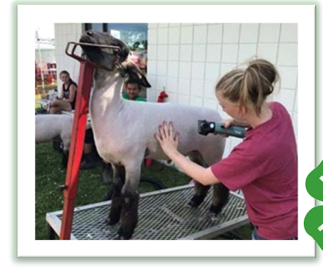
Backyard Bunch Club

Reach out to me if you would like to join us during Cherry Festival for this fantastic in-person experience! Please sign up for a three-hour timeslot during Cherry Festival week out at the Northwest Michigan Horticulture Research Center in Leelanau County! We are back in person at this event, taking place each day from 10:00 am through 1:00 pm, with clubs providing livestock projects for a fun petting zoo, setting up optional fundraising activities, and getting to practice being around crowds before fair. This is great outreach and a lot of fun! Let me know what day you would like: Wednesday, July 6 or Thursday, July 7 are still available!