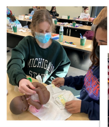
Diaper Changing Exercise