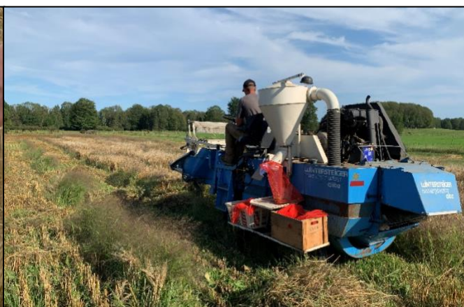
Figure 4. Harvesting ESNB Barely in Chatham