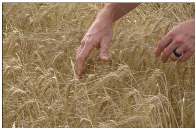
Figure 3. LCS Genie at Hickory Corners