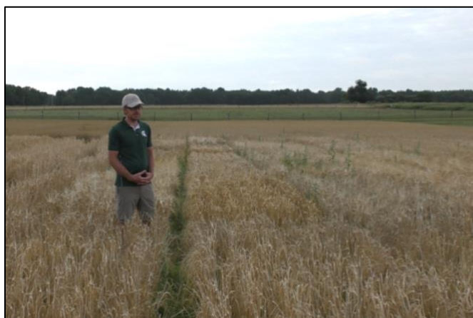
Figure 2. Hickory Corners plots near harvest