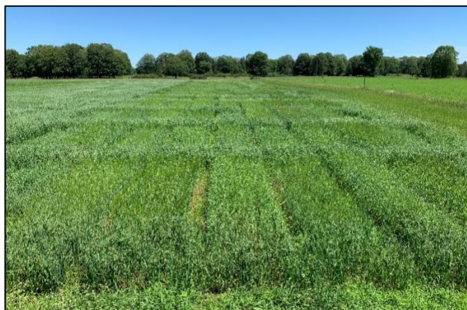
Figure 1. Chatham plots in early July