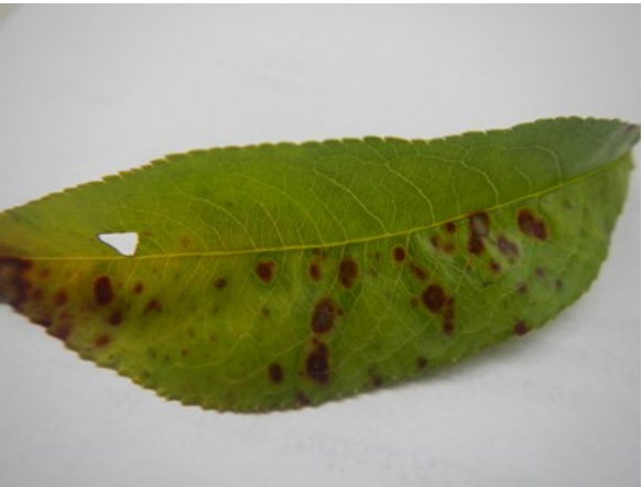
One of the many plant disease samples brought into the Extension office for identification.

4-H is the largest youth development organization in Michigan. Connected at the national level, MSU’s program promotes the traditional 4-H clubs and fair projects, as well as many other leadership and life-skills development opportunities for youth. 4-H provides experiential learning opportunities that allow youth to explore new interests and discover their passion. In 2017 Mason County had 25 4-H clubs serving 301 youth with 115 adult volunteers. The total number of youth served in the county was 1,869.