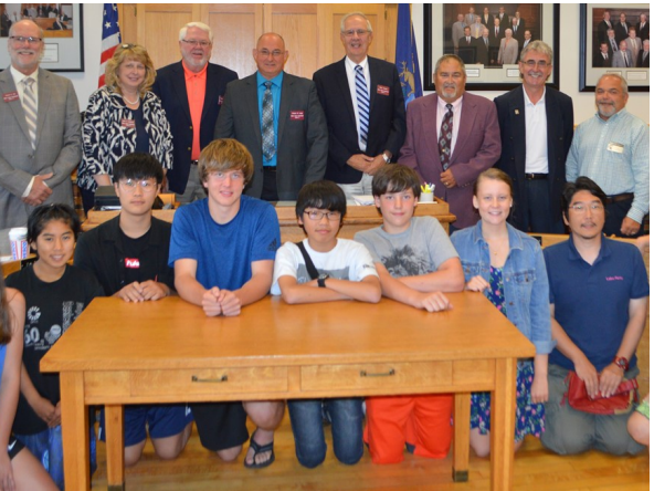
The Japanese and Korean exchange visited the Mason County board of commissioners in 2017.

Helping young people to explore and to appreciate what people around the world have in common and what makes them unique is critically important in society today. Michigan 4-H offers a variety of opportunities for kids and adults to learn more about our global community. In some cases, that perspective is gained through activities or projects that include art and letter writing. In other cases, it is gained through actually traveling to a different state or to other countries such as Belize, Norway, or Japan.