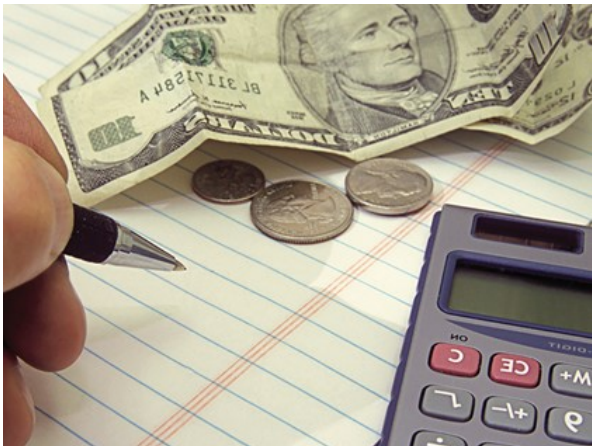
Budgeting classes help residents understand their limited resources and provide skills to help plan for homeownership.