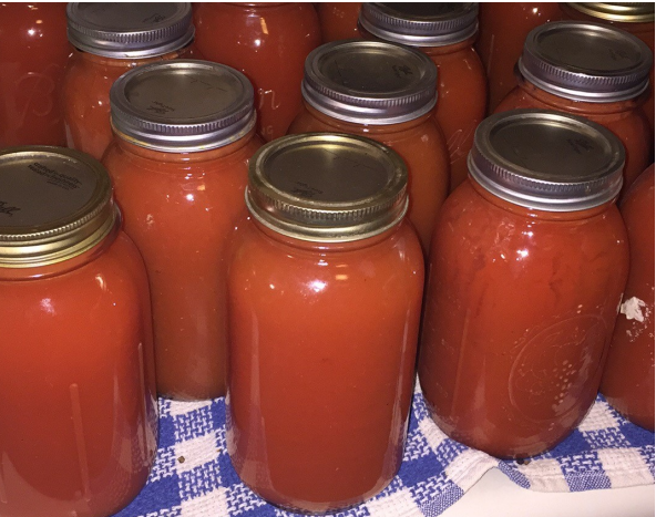
Learning to can using up-to-date safe methods reduces the risk of food-borne illnesses.

Providing assistance to help residents and businesses keep food safe is a hallmark of cooperative extension services across the country. In Mason County we provided ServSafe education for restaurant staff, home food preservation (canning, freezing and drying,) cottage food law trainings, assistance with food pantries, and pressure canner gauge testing.