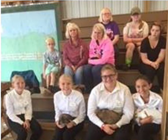
4-H youth prepare for showing their rabbits at the fair.

MSU Extension’s team of knowledgeable financial pros demystify common money and homeownership best practices with university-backed, research-based programs and resources to help Michigan residents navigate through whatever fiscal challenges life throws their way. In 2017, the team provided homeowner education, money management, foreclosure counseling and Step-Forward Michigan assistance in Mason County.