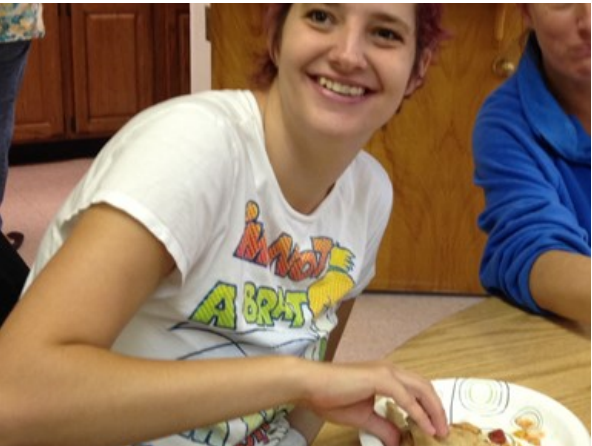
Kids learn to make healthy snacks during “Cooking Matters for Teens.”

MSU Extension’s Supplemental Nutrition Assistance Program provides basic nutrition education and hands-on activities for all ages. Core curricula are designed to help low-income families stretch their food dollars while maintaining good nutrition. Some instruction includes physical activity and cooking techniques that help instill life-long skills. It is estimated that every $1 spent on nutrition education saves as much as $10 in long-term health costs.