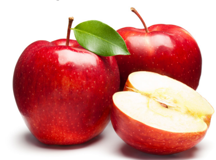
MICHIGAN STATE | Extension