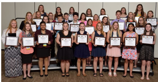
2017 State Award winners with their plaques at 4-H Exploration Days.

Michigan 4-H true leaders ages 11 and older have an opportunity to be recognized for the great work they do in 4-H by completing a state award application. A Michigan 4-H State Award is the highest honor bestowed on a Michigan 4-H member and provides an opportunity to receive recognition for their engagement in rich learning experiences that result in outstanding knowledge and life-skill development.