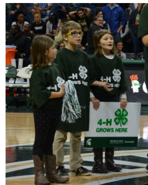
Michigan 4-Hers recite the American and 4-H pledges during the halftime show.

4-H alumni and their families are also invited to a special pre-event activity at Spartan Stadium, beginning at 1:30 p.m. To learn more, visit msue.anr.msu.edu/events/4_h_alumni_tip_off_reception .