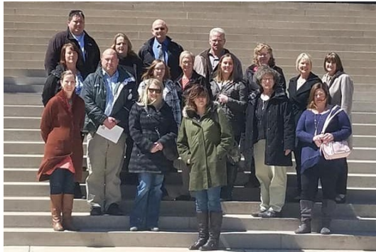
Leadership Montcalm XVIII Graduates in Lansing

"Leadership Montcalm has changed me. I am indeed a better person and leader because of the experience."