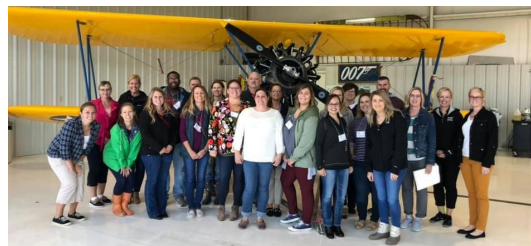
Leadership Montcalm XX participants in a hanger at the Lakeview Municipal Airport during the county tour.

Leadership Montcalm has been building leaders since 2000.