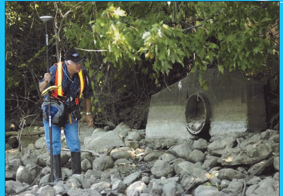
City of Lansing IDEP on the Grand River - Draw Down