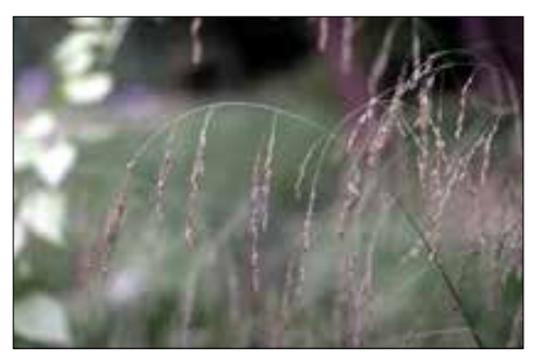
Where can you find this plant?