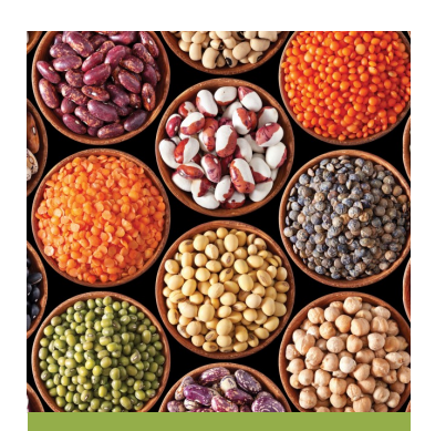
When you support MSU Extension, you help participants learn profitable and efficient business and production practices.

Michigan agriculture continues to be a growing segment of the state's economy. The production of commercial food and nonfood agricultural operations is growing rapidly. The number of households raising a portion of their own food and raising livestock or gardening for pleasure or relaxation continues to increase. When you support MSU Extension, you help participants learn profitable and efficient business and production practices. Participants also learn how to optimize and reduce the use of pesticides and fertilizers, and how to conserve and protect water resources. This education leads to better use of time, money and human capital, and helps retain and create agricultural jobs. These measures strengthen Michigan's economy while connecting farmers to local food opportunities and global markets. In this way you help MSU Extension encourage growth in a sustainable and prosperous Michigan food and agriculture system.