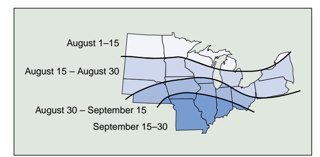
Figure 2. Preferred late summer seeding dates for grasses.

Some forage species are better suited to certain soil types than others. For example, alfalfa has an optimum soil pH of 6.8 but will grow at soil pH 6.0 with reduced yield. Birdsfoot trefoil, red clover, ladino or white clover, however, have an optimum soil