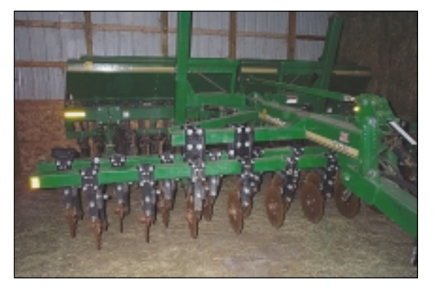
A no-till drill with fluted coulters for ease in cutting through crop residue.