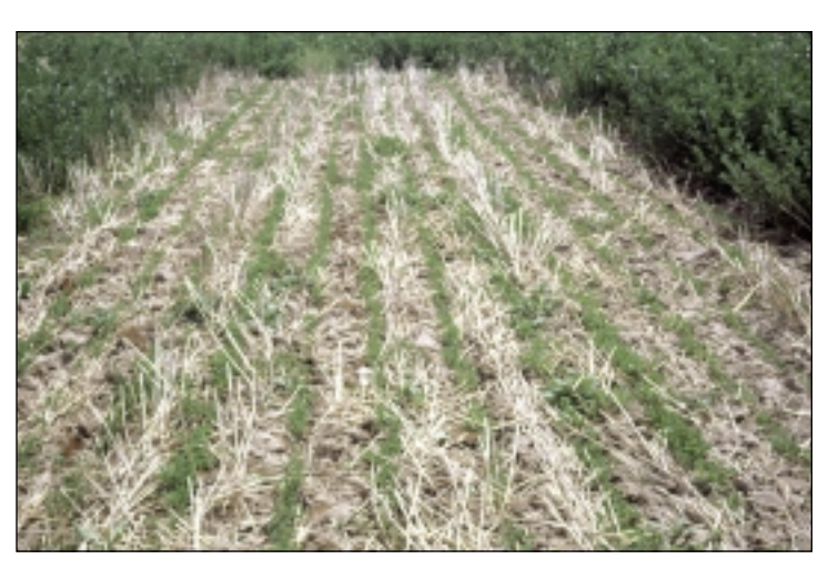
Legume establishment into wheat stubble using a no-till planter.

Non-uniform areas should be subdivided on the basis of obvious differences such as slope position or soil type. Soil samples used for nutrient recommendations should be taken to a depth of 6 inches. When nitrogen fertilizer is on the surface of no-till fields for a number of years, the