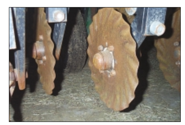
Fluted coulters are used for cutting through crop residue.

Three types of furrow openers are commonly used on disk drills: double-disk openers, single-disk openers and offset