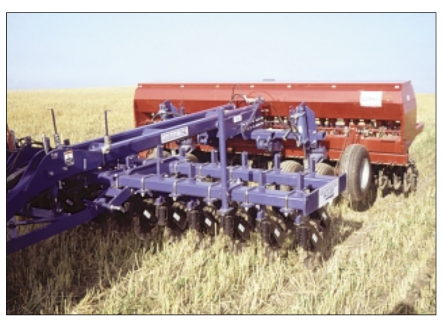
No-till planting into row crop or small grain stubble usually results in better stands than planting into old sod.

and prevent pulling of plants by grazing animals. In contrast, notill seedings into suppressed sods need to be "flash" or mob grazed before the existing sod completely overtops the developing seedlings to reduce competition. This mob grazing is best done with a 1- to 3-day grazing period. It should be delayed if soil moisture is high to reduce damage to developing seedlings. Producers