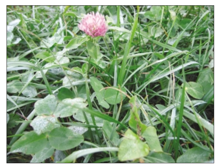
Red clover successfully established into a grass pasture.

Banding phosphorus at planting can be very beneficial, according to MSU alfalfa research in