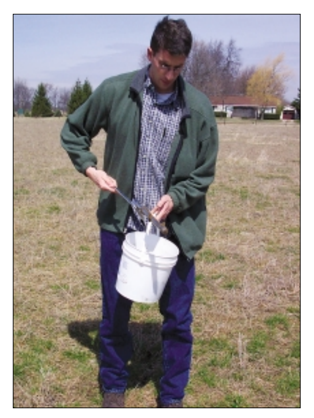
Collect 20 cores in a random manner and place into a plastic bucket for mixing.

"Neutralizing value" or "calcium carbonate equivalent" compares a liming material to pure calcium carbonate. Calcite is pure calcium carbonate and contains 40 percent calcium. Dolomite is a mixture of calcium and magnesium carbonate and contains 21.6 percent calcium and 13.1 percent magnesium. Analyses of limestone materials range widely. There are no clear standards for the term "calcitic or dolomitic limestone". Generally, if a liming material is greater than 2 percent magnesium, it is called dolomitic limestone; otherwise it is called calcitic limestone. Most liming materials are mixtures of calcium and magnesium carbonate. Neutralizing value is usually