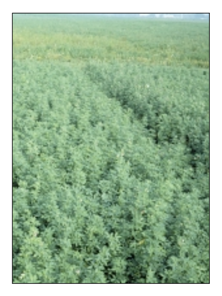
Results for no-till alfalfa are similar to those for alfalfa established using conventional tillage with modern drills.

Autotoxicity in alfalfa is a process in which established alfalfa plants produce chemicals that escape into the soil and reduce establishment and growth of adjacent new alfalfa. Negative effects of autotoxicity can remain in the field even after the plants are killed and inhibit growth of the new alfalfa if it is planted too soon after the death of the old stand. The main effect of alfalfa autotoxicity is reduced development of the seedling taproot.