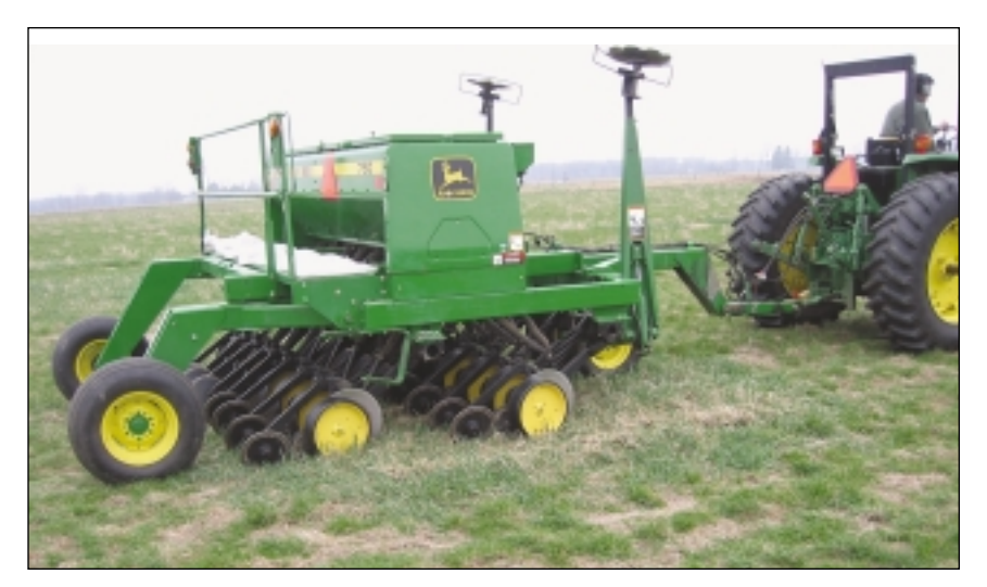
Interseeding into an existing pasture to improve stand density (note bare areas in the pasture.)

Sample distribution usually depends on the degree of variability in a given area. In relatively uniform areas smaller than 20 acres, a composite sample of 20 cores taken in a random or zigzag manner is usually