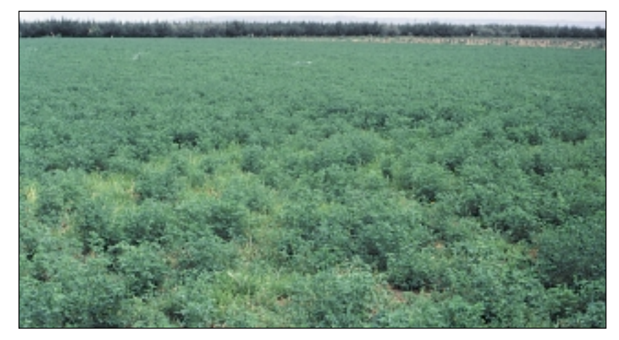
An established field of alfalfa showing significant stand decline caused from poor internal soil drainage. The use of tile drainage or selection of another species such as birdsfoot trefoil would be appropriate in this situation.

well-drained or tiled, all soil management groups (soil classes 1 to 5) and all textures are suitable for no-till establishment and production of alfalfa and other forage crops such as cool-and warm-season grasses and other legume crops.