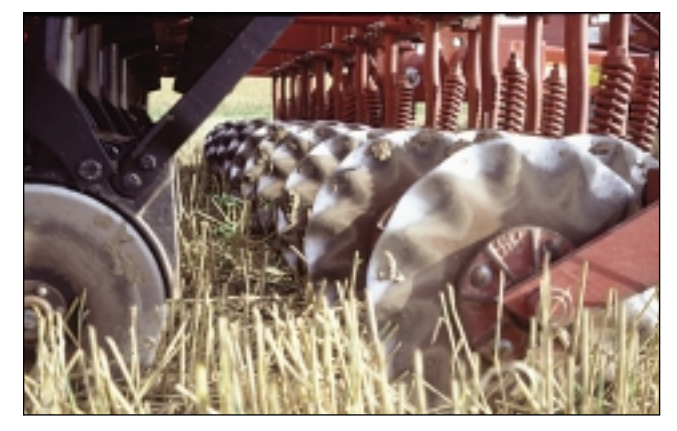
Fluted coulters need to be adjusted for downward pressure for proper zone tillage.