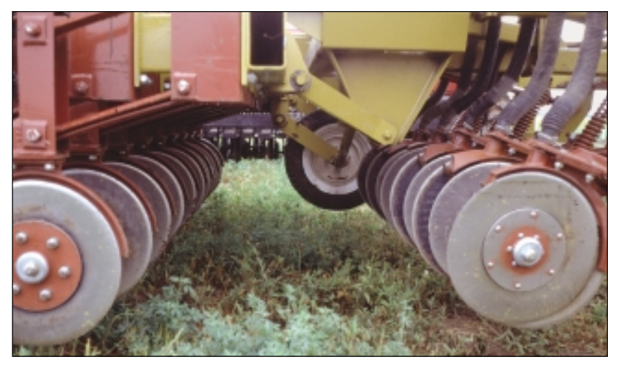
A no-till planter showing seed openers and steel press wheels.

A diet scale is an inexpensive and effective tool for calibrating seeding rates and can be purchased at grocery stores and pharmacies for generally less than $10. It can save many dollars by preventing over- or under-seeding with expensive forage seed.