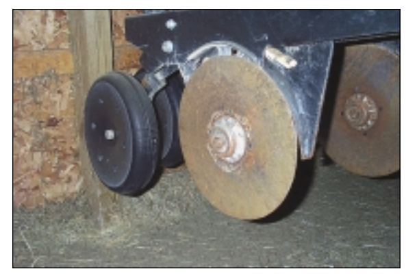
Seed opener and press wheel.

Coulter depth adjustments vary among drills. Depth adjustments usually involve moving clips to increase pressure on the opener rod pressure rings or adjusting the depth rod on the gauge-press wheel assembly. Depth control is not as precise with no-till drills as with row-crop planters, unless the drills have depth control bands on the furrow opener similar to those on a row crop planter. When planting condi-