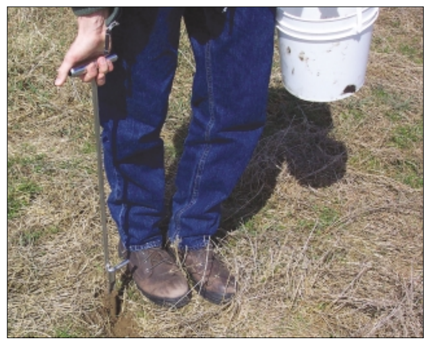
Collect soil cores with a sampling device like this step-in soil probe.

Factors that affect reaction time of a liming material include particle size and surface area or porosity of the material. If the liming material source is one that reacts slowly, you must allow more time before growing a pH-