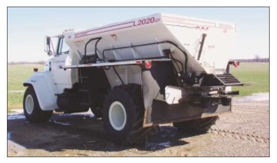
Lime should be spread one year prior to planting.

Planting conditions for directdrill seeding are not as uniform as in conventionally tilled fields with a prepared seedbed, but planting objectives are the same. The drill must open a seed furrow, place the seed at approximately ¼ to ¾ inch deep, and cover and firm the soil over the seed. Conventional drills are designed to sow into tilled, uniform soil conditions. No-till drills can operate in tilled fields but are designed for tougher conditions such as sods and firmly compacted, uneven or residuecovered soils. For no-till establishment of small-seeded legumes or grasses, the drill is the most important piece of equipment you will use. It must be adjusted correctly and be