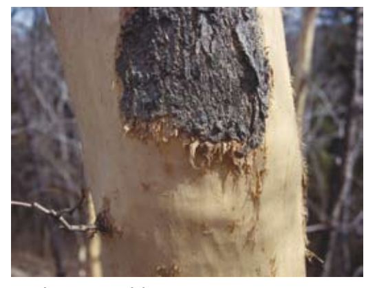
Bark stripped by porcupines.

and shrubs. Habitat reduction is the first line of defense against small rodents. Unfortunately, many of our prized plant compositions also make for ideal cover. Minimizing cover may deter feeding but does not eliminate it. Caging plant crowns, wrapping wire mesh around the bases of the plants, applying feeding repellents and using poison baits work reasonably well. Quite often our best bet is to apply multiple methods in various combinations. When repellents are used, keep in mind that they degrade in winter weather and need to be reapplied throughout the season. Poison baits are often used for mice and should be positioned to avoid feeding by other animals.