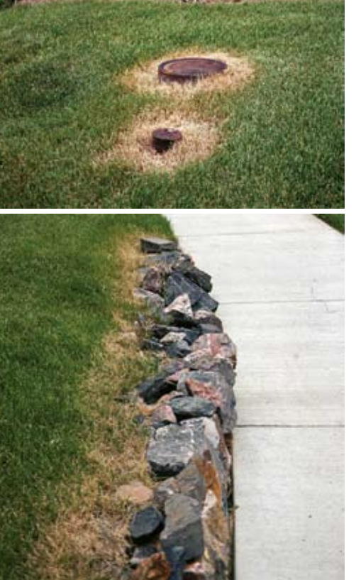
Two examples of improper use of non-selective herbicide.