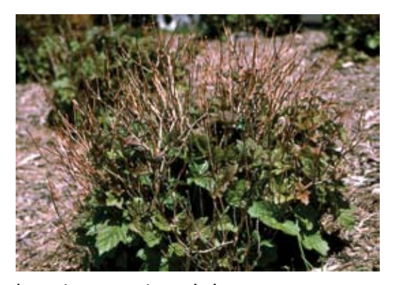
Low-temperature injury on deciduous shrub.