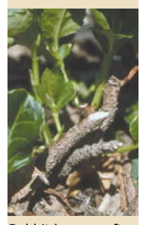
Rabbit browse often looks like pruning cuts at the bases of shrubs.