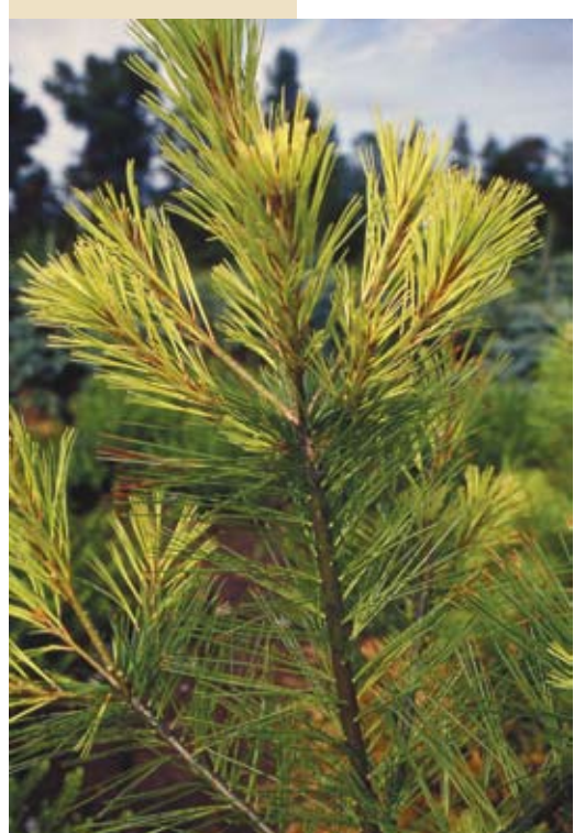
Nutrient deficiency on white pine.

Nutrient problems rarely kill plants outright, but proper nutrient management is essential to optimizing growth and maintaining high quality plants. Most nutrient problems are related to nutrient deficiencies, although nutrient toxicities may occur.