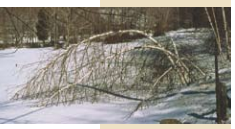
Birch is often temporarily bent by snow and ice loads on branches.