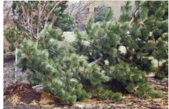
Shallow root development on compacted soils.