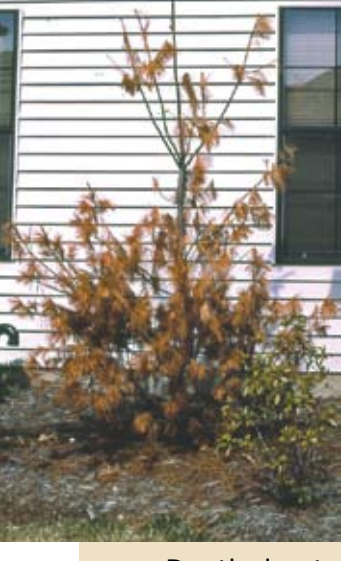
Death due to poor soil drainage.

when referring to plant preferences. Unfortunately, this condition is not the rule in most planting situations. Sandy soils need amendments to increase water- and nutrient-holding capac-Clay soils ity. need alterations to facilitate drainage. A thorough examination of soil physical and chemical properties can aid in avoiding common problems associated with water deficits, flooding and nutrient disorders.