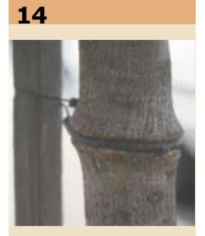
Mechanical injury due to staking practice.