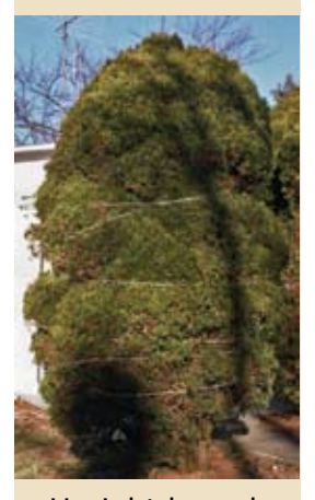
Upright branches of arborvitae are tied to prevent snow and ice injury during winter.