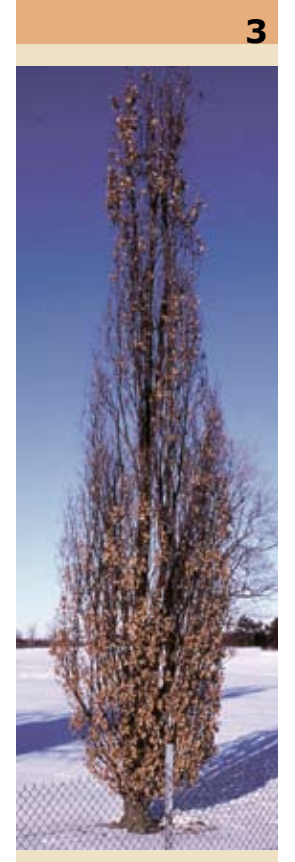
Leaf retention on oak.

systems, signs of graft incompatibility may be visible as an uncharacteristic intensity of the fall color. Disruption of translocation leads to a buildup of sugars during leaf senescence that intensifies fall foliage color. This is especially the case on Acer rubrum cultivars with known incompatibility problems. Graft incompatibility issues on these Acer rubrum cultivars led to production on their own roots. Graft incompatibility remains a concern in fruit tree production. Incompatibility is not easily detected and can surface at various times in a plant's life. Unfortunately, for many it surfaces when the trees are mature and affected by wind or some other environmental condition. Graft incompatibility can result in semimature trees snapping off at the base in wind storms. Failure of the tissue union is visible at the trunk/root col-On plant species with known lar. problems, check on the budding or grafting practices during production. Another form of incompatibility occurs when there are differences in growth rates between the scion and the understock. These differences can lead to disproportional growth at the junction of the two tissues.