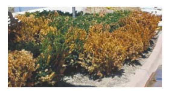
Salt injury on taxus.

Winter brings snow and ice and with them the need for deicing materials. Salt used for deicing affects plants in the landscape when it accumulates on stem tissue by airborne sprays and/or in soils because of runoff from treated areas. Soil buildup is especially a problem in landscape beds adjacent to sidewalks or curbs where snow accumulates through plowing and shoveling. Deicing salts damage plants through direct sodium chloride toxicity, dehydration due to osmotic stress, reduced cold hardiness due to salt buildup on buds and stems, and/or its influence on soil nutrients. Salt injury usually expresses itself as terminal shoot dieback, bronze foliage on evergreens, bleaching of ground covers and turf, or total plant death in the case of ground covers and perennials. Successive years of dieback on woody trees and shrubs could result in a "witches' broom" appearance on the outer branches. Given winter conditions, it is essential to deal with deicing in the landscape design phase. Deicing practices must be considered in plant selection and landscape bed design in close proximity to paved surfaces. If we are not fortunate to have an input on design and selection, we must intercept airborne salt through screening or apply more plant-friendly deicing materials such as calcium magnesium acetate.