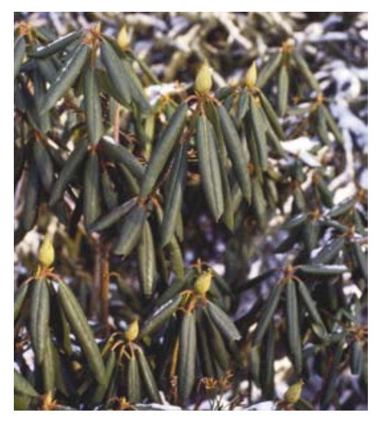
Leaf curl on broad-leaved evergreen due to low-temperature injury.

Low-temperature impacts on plants can be classified as chilling or freezing. Chilling injury or chilling stress, as it is often termed, is associated with temperatures above freezing but low enough to cause injury. Chilling injury is due to a sudden drop in temperature during an