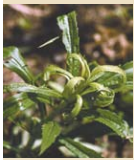
Leaf cupping/ curling due to a growth regulator herbicide.