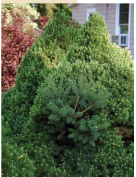
Genetic reversion on dwarf Alberta spruce.

Genetic anomalies are prevalent in the plant world and often garner much