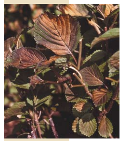
Sunburn on summer foliage.