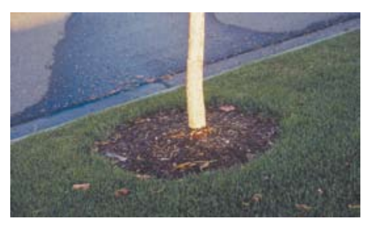
Maladjusted irrigation head.

expansion, shoot expansion and root initiation require water at fairly regular intervals. Once plants are established, however, irrigation can be adjusted accordingly. Abiotic problems related to irrigation operation can be due to moisture deficits resulting from improper scheduling and delivery or to flooding due to the failure of valves to shut off appropriately. Problems can be avoided by periodic checks to ensure that the system is operating correctly and delivery is appropriate for the plant, season and soil type.