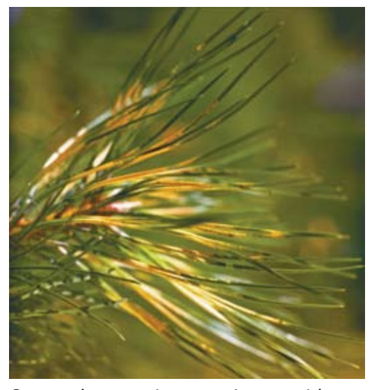
Ozone damage is sometimes evident as stippling or bleaching of needes in conifers.

Sulfur dioxide is another pollutant that can injure plants. Sulfur dioxide emissions result from the burning of coal and other petroleum products. Improved filtration technology and emission controls have substantially reduced sulfur dioxide injury. Isolated cases of volatile chemical spills or emissions may subject plants to injury. Such cases are usually easily diagnosed because of the close proximity of the plants to the isolated event.