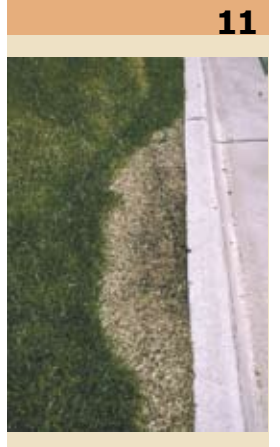
Salt injury on turf.

Herbicide injury symptoms vary with the plant and the herbicide applied. Understanding the mode of action of herbicides and their effects on non-target plants will aid in recognizing injury symptoms and distinguishing herbicide injury from other abiotic and biotic problems. Three widely used types of herbicides are growth regulators, photosynthetic inhibitors and plant enzyme inhibitors. Growth regulatory herbicides such as 2,4-D are plant hormones that act by causing irregular growth. Essentially, weeds grow themselves to death. Symptoms of plant growth regulator herbicides' action on weeds include leaf cupping and twisted, distorted growth. These same symptoms are found on non-target plants. Photosynthetic inhibitors such as atrazine and simazine act by interrupting normal photosynthesis. These compounds block the mechanism that transforms sunlight into energy. Photosynthesis inhibitors require sunlight to work. Injury symptoms, which