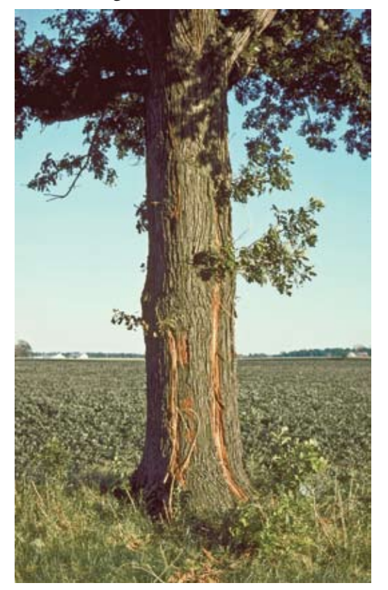
Lightning strikes can result in extensive damage to bark and underlying cambium.

Summer storms are a normal occurrence in the Midwest, and with them come lightning and, in some cases, hail. Trees in particular can be killed outright or severely damaged by lightning strikes. When lightning strikes a tree, it can fracture and splinter the wood or travel down from the entry point to the ground, carving a groove in the conductive tissue and bark. The extent of the injury depends on the intensity of the lightning, where it enters, the moisture level in the tissue and the wood characteristics. Recommendations for treating lightning strikes are relatively simple: clean the damaged areas, removing splintered wood and tracing loose bark back to firmly seated bark, and provide cultural practices that invigorate and promote plant growth, such as irrigation and fertilization.