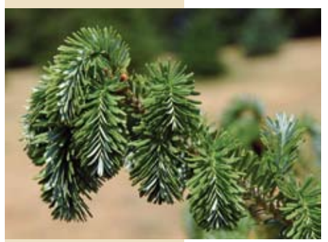
Wilting of conifer leaders.

Moisture stress and extreme heat can greatly reduce plant growth, especially caliper growth. Heat can directly injure plants in extreme conditions, but the