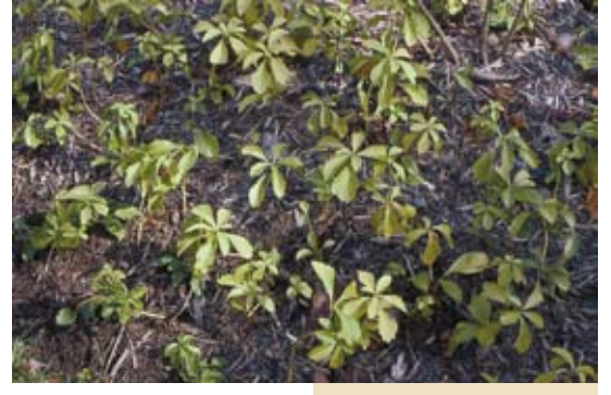
Chlorosis on pachysandra due to excessive moisture stress.