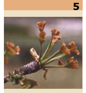
Chilling injury on newly emerged leaves of ginkgo.

Preseason conditioning refers to the physiologic and metabolic changes that occur within a plant as it begins hardening. The process leading to cold hardening is generally considered a three-stage process. The first stage occurs at the end of the growing season. Growth has ceased, plants have formed terminal buds, and carbohydrates are accumulating in stem and root tissues. Short days and cool night temperatures of early autumn begin the acclimation. During acclimation, metabolic changes occur within the plant that allow it to withstand lower temperatures. During the initial stages of acclimation, however, hardiness levels may be lost as easily as they were obtained if temperatures rise or other environmental factors promote the resumption of growth. Acclimation continues and hardiness tolerance increases with consistent exposure to temperatures at or slightly below freezing. The final stage, the deepest level of cold hardiness, is achieved after prolonged exposure to subfreezing temperatures. Plants are said to be at midwinter levels when they reach their maximum cold tolerance for a given season. In the Midwest, maximum levels of hardiness are usually achieved by early January. As spring approaches, plants begin to deharden or lose cold tolerance with increasing temperatures. Late frosts can cause injury during this dehardening phase when plants begin to break bud and initiate shoot growth. Remember that plant parts differ in their cold tolerance.