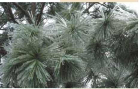
Ice load on pine.