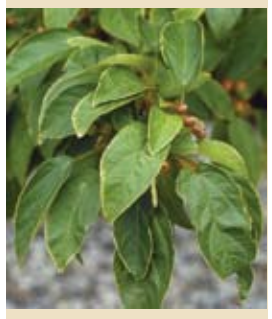
Marginal chlorosis from herbicide injury.