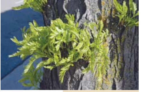
Proliferation of trunk sprouts leads to callus buildup.

Galls and burls are abgrowths normal on woody plants. They can occur on branches, trunks and, in some cases, on roots of woody plants. Galls may be caused by an insect or disease; however, the origin or causal factors for burls and other callus outgrowths are unknown. Abnormal growths form through a proliferation of cells. These cells continue to develop and do not differentiate into normal tissue types. In some cases, the outgrowth results from a cluster of shoots. Each year, new shoots are initiated and increase the layers of the mass.