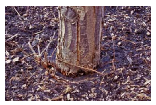
Excessive wetness on trunk due to mulch buildup.

Proper installation and operation of irrigation systems is essential for effective and productive plant growth and development. Proper timing, frequency and rate of application not only ensure plant health and vigor but also provide for the efficient use of water resources. Supplemental irrigation is necessary during plant establishment. Demands for water during leaf emergence and