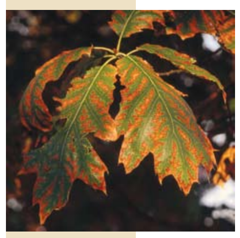
Leaf scorch on oak.

principal effect of heat is increased water loss and plant moisture stress. Moisture stress can cause significant mortality, particularly soon after transplanting. Wilting is the most common initial symptom of drought stress. Hardwood leaves and conifer leaders will curl or droop. As drought progresses, hardwood trees may begin to shed leaves, and conifers may begin to drop interior needles. Drought stress, however, reduces growth before visible symptoms such as wilting or leaf shedding become apparent. Even moderate stress can cause the stomata on the leaves to begin to close, reducing photosynthetic production. Caliper growth is highly sensitive to water stress because cell turgor is required for radial expansion of new wood cells formed by the cambium. In fact, the high sensitivity of radial growth to moisture forms the basis of dendrochronology, the science of using tree rings to reconstruct past climates. Drought and heat stress can also cause some plant species to enter into an imposed dormancy. This mild state of dormancy can satisfy the chilling re-