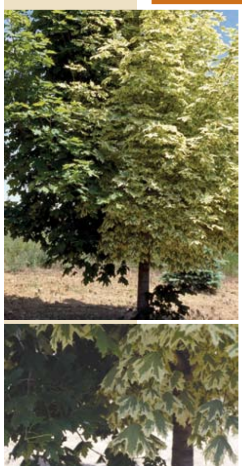
Genetic reversion on Harlequin maple.

The genetic makeup of a species is expressed through its physiological and morphological characteristics. Whether these characteristics are perceived as normal or abnormal depends on the individual circumstances and location where they are found. Understanding the basis for these characteristics can be useful in determining wheththey need to be er addressed and can aid in outlining a course of action. In many cases, these characteristics are a fact of nature and simply need to be appreciated for what they are; in other cases, they can be altered or corrected by simple measures. Here are some common abiotic abnormalities that are biological/botanical in origin.