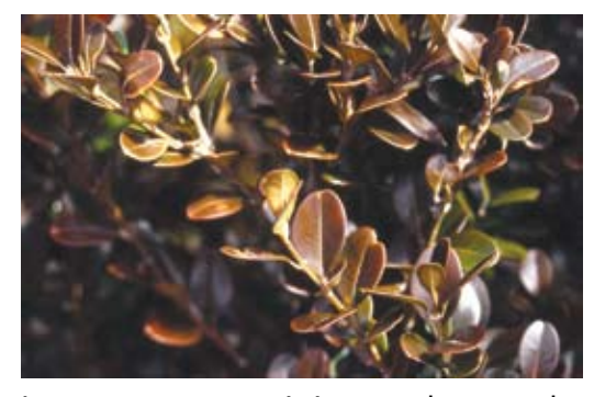
Low-temperature injury on boxwood.