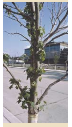
Crown dieback due to improper planting technique.

for white root tips and signs of root regeneration. Under drought or water deficits, white root tips will be absent, and existing roots will be dried and shriveled. Under excessive moisture and poor drainage, the root system will also lack white root tips and exhibit signs of anaerobic conditions. The blackened outer surface of the roots will slough off, exposing inner gray and water-soaked, stained tissue. In addition to the obvious plant symptoms, evidence of twine around the base of the trunk, scars from staking or other signs of mechanical injury may lead to conclusions on the causal factors and required treatment. Problems caused by poor planting procedures can be due to marginal plant stock quality; poor soil ball or container media moisture prior to planting or during establishment; improper planting depth, either too high or too low; compacted planting sites and poor drainage through the soil profile; improper irrigation scheduling following planting; and improper mulching practices.