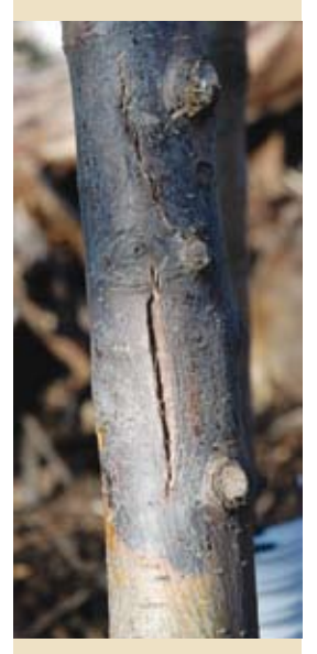
Sunscald and frost crack.

Flower buds usually do not achieve the hardiness levels that vegetative buds and stem tissue do.