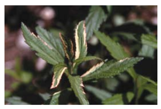
Chimera on Anthony Waterer spirea.

Chimeras are botanical abnormalities that are often confused with nutritional or chemical disorders. "Chimera" is a term used to describe a single plant with two genetically different tissue types. Leaf variegation is the most common example of chimeras in plant species. The difference in foliage color and the banding of those colors are due to cell mutations in the meristematic tissue layers. Chimeras can be stable, in that the genetic differences are consistent and reproducible. These chimeras have spawned numerous of our variegated plant cultivars. Chimeras can also be unstable and unpredictable, surfacing sporadically on either shoots or individual leaves. The Bumald spireas are known for the sporadic appearance of unstable leaf chimeras. The stability of the chimera depends on the tissue layer where the mutation occurs. If you discover variegation on an individual stem and not over the entire plant, it is possible that it is a chimera and not an abiotic disorder related to plant nutrition or chemical injury.