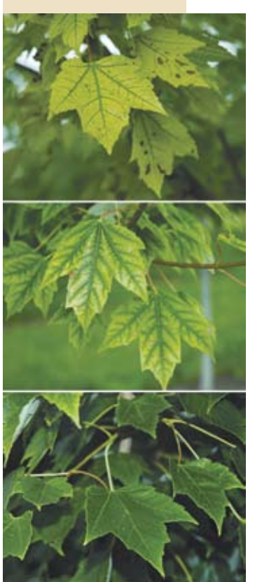
Top: Chlorosis due to nutrient deficiency. Middle: Manganese deficiency. Bottom: Normal red maple leaves.