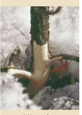
Mice damage.

The planting process involves the preplanting examination and evaluation of the plant stock type (bare-root, container, balled and burlapped [B&B], mechanical tree spade), the actual physical process of planting and the follow-up maintenance. Problems related to the planting process can originate within each of these. Consider the idiosyncrasies with each of the previously mentioned stock types, for example, the depth of the trunk/root collar on B&B trees, encircling roots in container-grown plants, root desiccation on bare-root plants and glazing in mechanical tree spade plantings. Each one of these factors can contribute to the success or failure of the plants. Improper handling and planting procedure contribute significantly to abiotic consequences, especially when they're combined with soil or environmental limitations at the planting site. Symptoms related to poor planting procedures are similar to those of drought and flooding: shoot dieback, reduced leaf size, minimal shoot growth, root injury and poor root regeneration. If plant excavation is possible, examine the root system