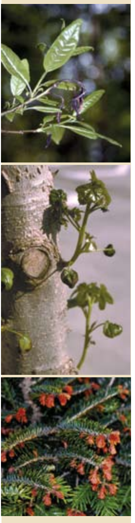
Late frost injury.