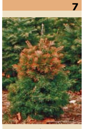
Winter desiccation on fir.

tearing and/or breakage. Plant architecture, branching structure and wood strength can be predictors of damage from excessive snow or ice load. Unfortunately, hidden cavities in the wood or flaws in branch attachment can increase the damage potential. Plants with multiple stems can be tied to provide support. This may be especially helpful on upright narrow-leaved evergreens. Excessive amounts of snow can be carefully removed to alleviate the stress on lateral branches. Ice should be allowed to melt naturally. Branches