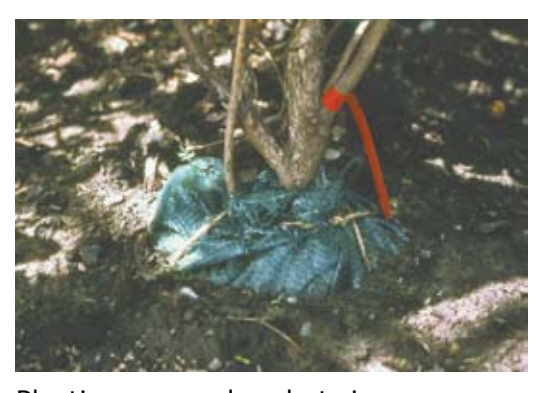
Plastic wrap and poly twine on a B&B shrub.