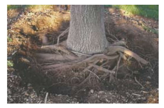
Girdling roots on red oak.