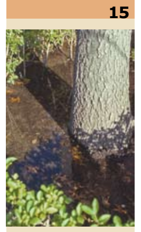
Broken irrigation emitter on street tree.

expansion, shoot expansion and root initiation require water at fairly regular intervals. Once plants are established, however, irrigation can be adjusted accordingly. Abiotic problems related to irrigation operation can be due to moisture deficits resulting from improper scheduling and delivery or to flooding due to the failure of valves to shut off appropriately. Problems can be avoided by periodic checks to ensure that the system is operating correctly and delivery is appropriate for the plant, season and soil type.