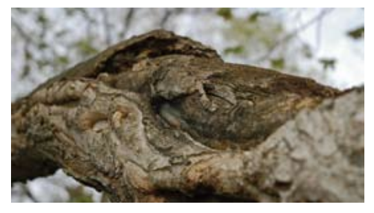
Squirrel gnawing leads to extensive stem decay.