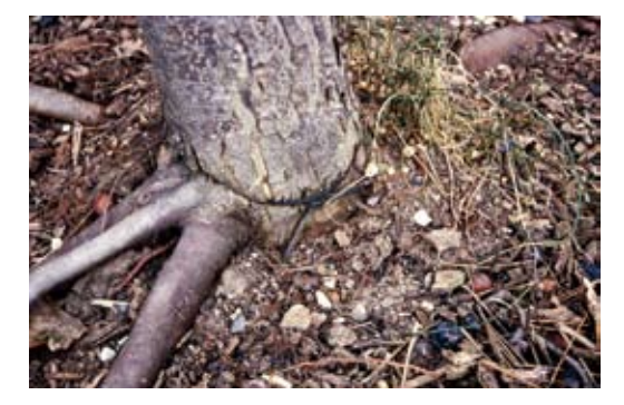
Polytwine left on a B&B tree.

Girdling roots have long been recognized as an abiotic problem in both