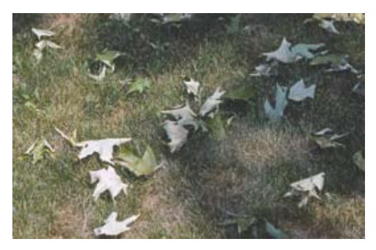
Squirrels foraging on the petioles of newly expanding leaves cause leaf drop in late spring/early summer.

The issue of food supply and demand is a concern when we are investigating animal damage. When forage becomes limited, many of our ornamentals become prime targets for deer, rabbits, squirrels, mice and other rodents. Some ornamental species such as tulips, hostas and taxus are preferred over natural forage. Deer browse is obvious on taxus, arbovitae and other evergreens. Squirrels may feed on the petioles of newly expanded leaves or gnaw on the upper sides of branches within tree canopies. Rabbits, mice and other rodents focus on the ground-level portions of deciduous trees