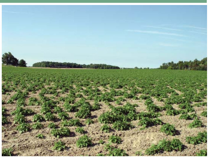
Figure 6. Seed piece decay and sprout rot lead to poor and uneven stands with weakened plants.