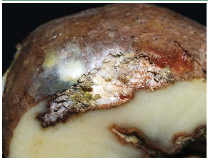
Figure 3. Clumps of mycelium and white to pink to yellow sporulating masses form on the surface of dead skin.

Pythium leak and pink rot also cause brown to black internal discoloration of tubers. However, these are wet rots, and tubers exude a clear fluid when squeezed.