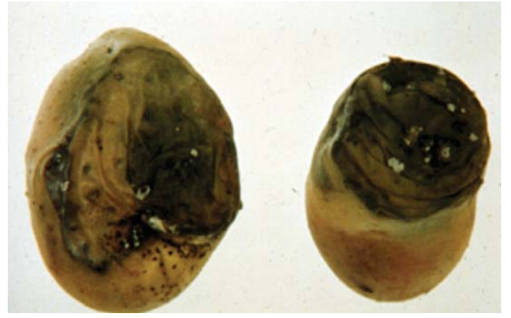
Figure 1. External symptoms of Fusarium dry rot. Dark depressions form on the surface of the tuber, and the skin becomes wrinkled as the underlying tissue desiccates.

The first symptoms of Fusarium dry rot are usually dark depressions on the surface of the tuber. In large lesions, the skin becomes wrinkled in concentric rings as the underlying dead tissue desiccates (Fig. 1). Internal symptoms are characterized by necrotic