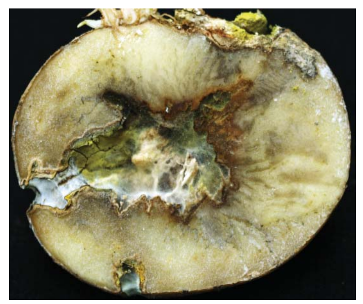
Figure 2. Internal dry rot symptoms. Clumps of white to yellow mycelia line a dry necrotic cavity hollowed out from rotted tissue.

Dry rot diagnosis may be complicated by the presence of other tuber pathogens. Soft rot bacteria ( Pectobacterium spp.) often colonize dry rot lesions, especially when tubers have been stored under conditions of high relative humidity or tuber surfaces are wet. Soft rot bacteria cause a wet, slimy rot, which can rapidly engross the entire tuber and mask the initial dry rot symptoms (Fig. 4). Dry rot may also accompany late blight infection of tubers and be followed by soft rot bacteria, leading to tubers with symptoms of all three diseases (Fig. 5).