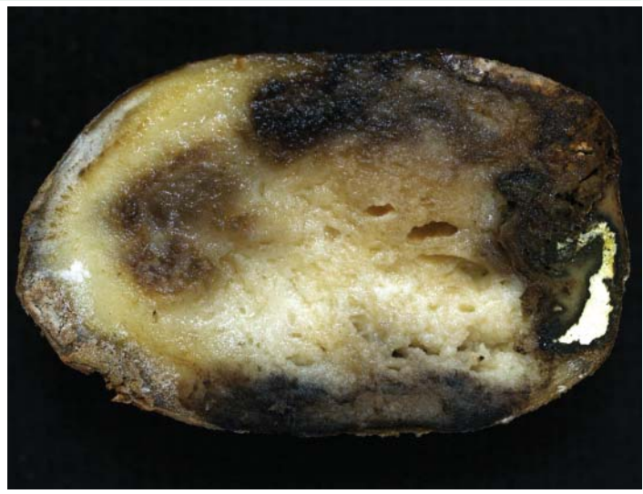
Figure 4. Dry rot is often followed by bacterial soft rot, which makes the tissue soft, mushy and slimy.

Fusarium species are common in most soils where potatoes are grown and can survive as resistant spores free in the soil for very long periods of time. There are two main opportunities in the potato crop cycle for Fusarium species to infect potato tubers in the spring and in the fall (Fig. 7). Fusarium sambucinum and F. solani are commonly found on seed tubers in the spring. Potato seed tubers are maintained in storage at 37°F, which is approximately the temperature at which F. sambucinum is dormant, and consequently, there is minimal development of dry rot in storage. However, some level of Fusarium dry rot is almost always present in commercially available seed. During the preplanting phase of potato production, seed tubers are warmed to about 54°F, then cut into seed pieces prior to planting. Tubers infected with F. sambucinum are particularly susceptible to the development of seed piece decay during this phase. In cases of severe disease, seed pieces may rot completely before planting. Alterna-