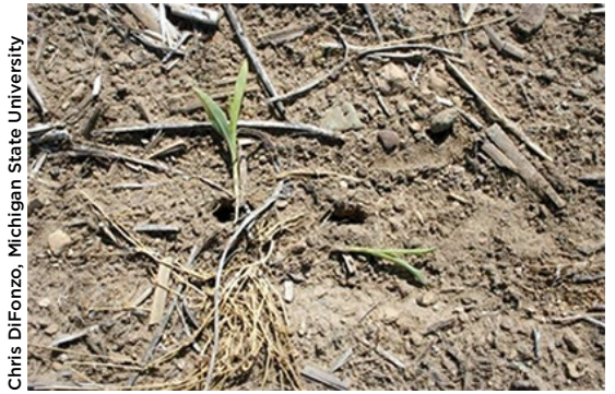
Typical sandhill crane damage to sprouting corn. Note the round holes in the soil where cranes have pulled the sprout to eat the seed.

In spring, damage can be substantial, as cranes often gather in large numbers in germinating cornfields. These large congregations of cranes are made up of non-breeding birds that move about the landscape