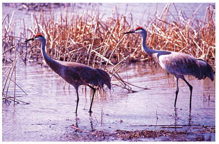
A pair of sandhill cranes.

Hunting: Hunting sandhill cranes is not currently legal in any Midwestern states. Some southern states do allow crane hunting. However, hunting sandhill cranes will not directly reduce corn damage because it occurs in the spring and crane hunting usually takes place in the fall. However, fall hunting could help to reduce damage to fall sown crops like winter wheat or maturing potatoes.