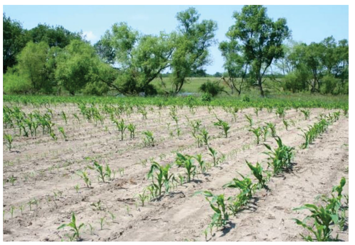
Patchy corn left after sandhill cranes damaged a field.

opportunistically. These birds do not have territories and can range over large areas to feed. Breeding birds segregate in pairs to defend a territory against other cranes and therefore, the damage they do is usually minor by comparison.